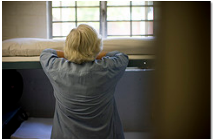
Sin by Silence, a documentary about Convicted Women Against Abuse will be screened at YSU as part of Women's History Month.

Sin by Silence, March 30, 1 p.m. in YSU McDonough Museum of Art, co-sponsored by United Purpose II. Screening and discussion of the film about the first inmate-initiated and led support group in the U.S. prison system that reveals the history and stories of the members of the group, Convicted Women Against Abuse.