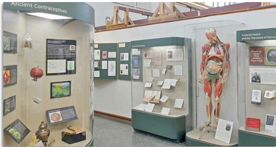
Contraception exhibit at the Dittrick Medical History Center at Case Western Reserve University.