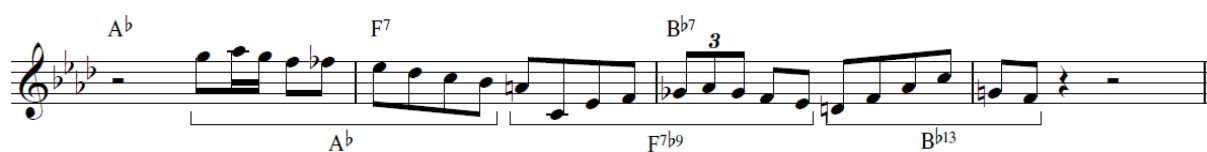
Example 3b: “Donna Lee,” mm. 1-4, normalized