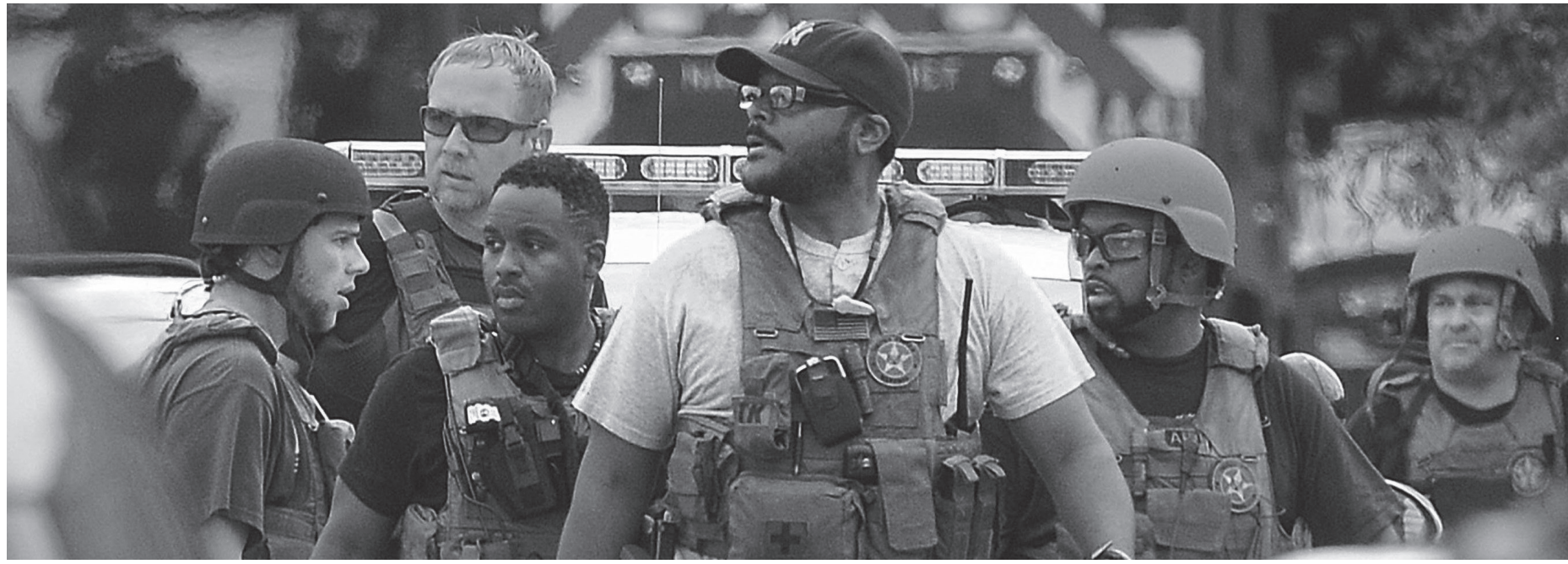
Law enforcement personnel respond to an attack on office workers at Washington Navy Yard Monday morning, September 16, 2013. A gunmen opened fire and killed at least 12 people in the attack in Washington, D.C.