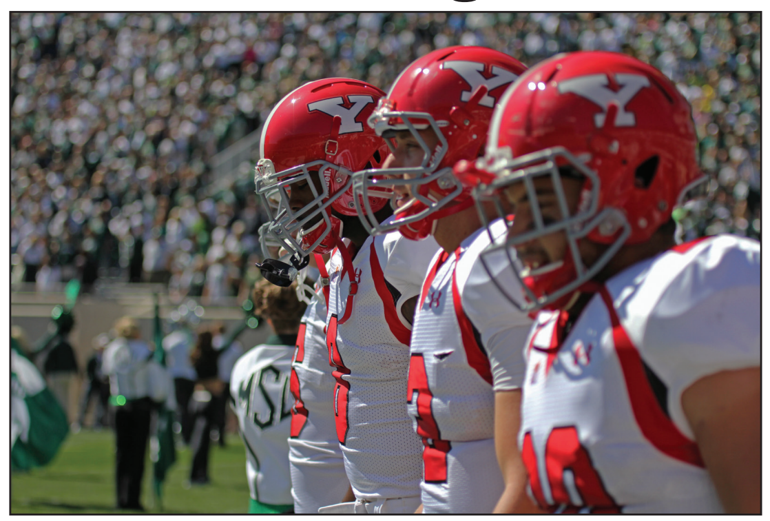
Youngstown State captains walk onto Spartan Stadium for the coin toss before kickoff of Saturday's matchup against Michigan State. The Penguins lost to the Spartans 55-17, dropping their record to 2-1.