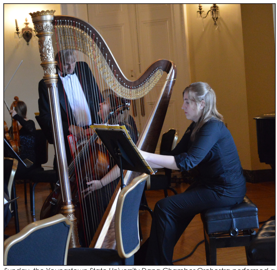
Sunday, the Youngstown State University Dana Chamber Orchestra performed a concert at Stambaugh Auditorium in the Christman room.