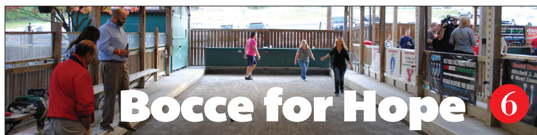
Bocce for Hope 6