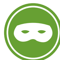
BURGLARY & ROBBERY