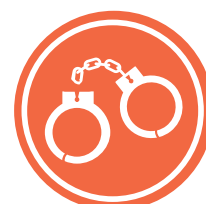
ARRESTS FROM DRUGS, ALCOHOL, WEAPONS