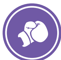
DATING & DOMESTIC VIOLENCE