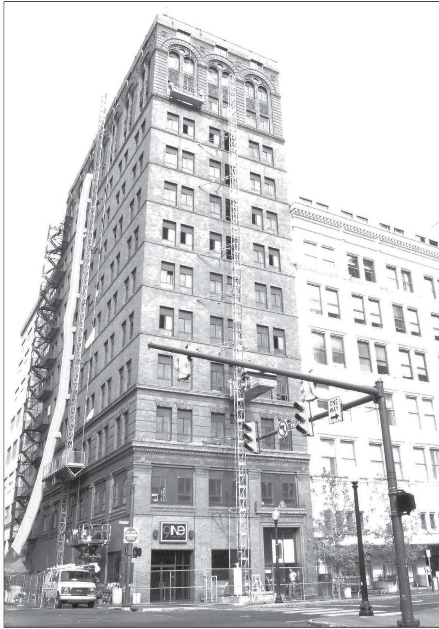
Wick Tower, on the northeast corner of W Federal and N Phelps Streets downtown, is currently being renovated. The building will contain 50 apartments and have commercial space available on the ground floor.