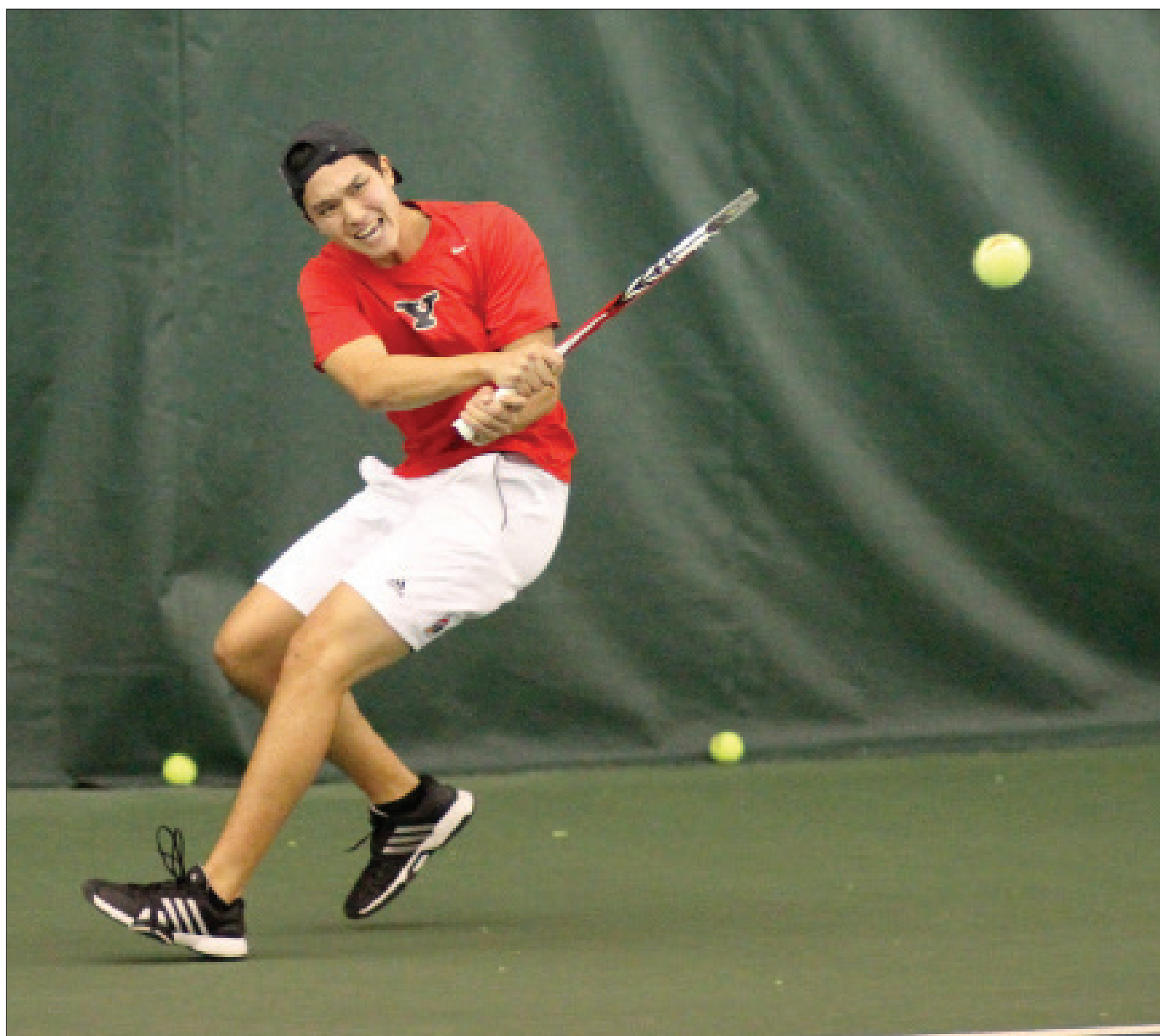
The Youngstown State University men's tennis team will host Cleveland State University on April 4. The Penguins are 6-9 and 2-0 in Horizon League competition. After starting the season with 3-9, YSU has found itself on a three-game winning streak. YSU began its streak against the University of Detroit Mercy, and the team's success has carried over into conference play. The Penguins were 1-6 in their previous seven matches before the win streak. The Vikings are 11-5 (2-0) this season and tied with YSU for first place in the Horizon League. Matches are set to begin at 5 p.m. at the Boardman Tennis Center.

The Youngstown State University baseball team fell to Kent State University 12-6 on March 31. YSU took a 6-2 lead after three-run innings in the first and fourth. In the bottom of the fifth inning the Golden Flashes scored five runs to take a 7-6 lead. Kent State had another five-run inning in the bottom of the eighth to increase their lead to 12-6. The Penguins fell to 5-16 this season.