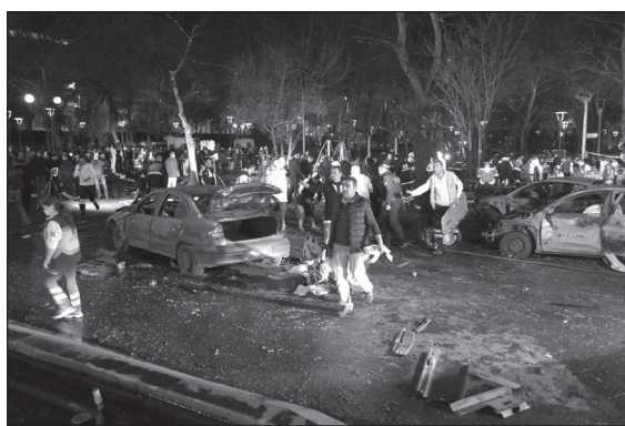
Rescuers work at the site of a car bombing at Kizilay Square in Ankara, Turkey, on Sunday, March 13, 2016. The explosion killed at least 27 people and injured 75 others.