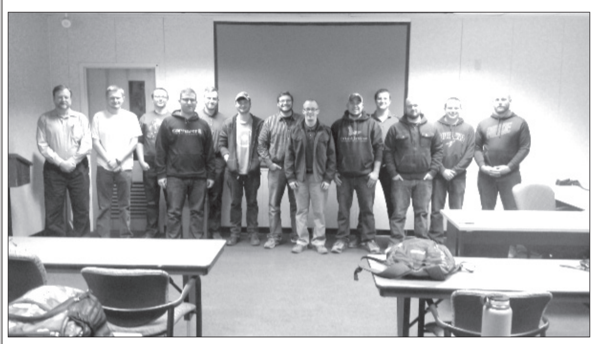
CONTRIBUTOR: SARAH RUANE | PHOTO: SARAH RUANE

The ELECTRI International and National Electrical Contractors Association's Green Energy Challenge is a vearly competition where students from different NECA chapters gather to come up with and execute a green energy project guided by different rules and requirements.