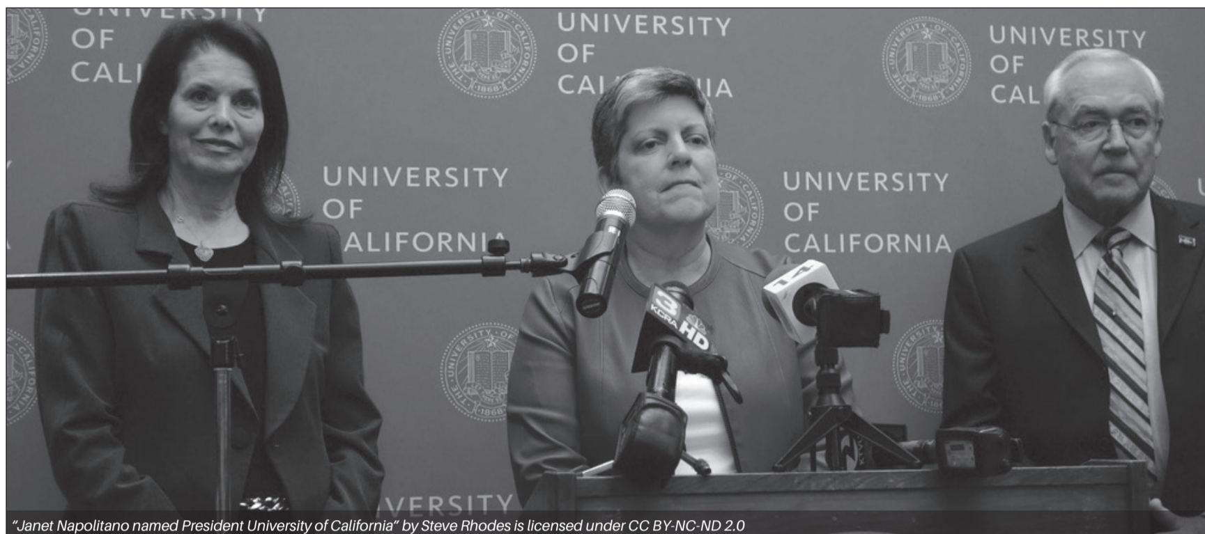
"Janet Napolitano named President University of California"