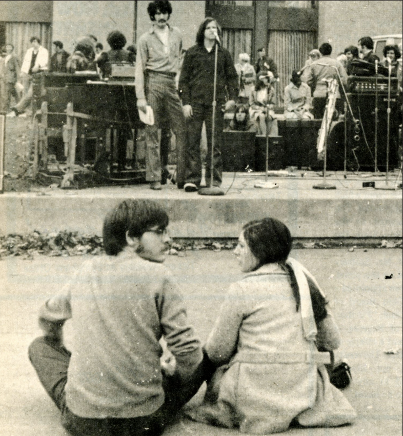
TÊTE-A-TÊTE – A couple, seemingly isolated from an all-campus rally, ponder questions raised by two Kent State students on the indictments at K_{SU}