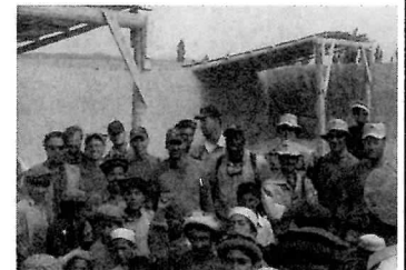
Building the school

In our free time, we helped build three schools for both boys and girls. No women in the last ten years had been able to attend school openly, and it is questionable how much education was available to the village girls prior to Taliban control when all formal education ceased except for teaching of the Koran to the young men. We also helped rebuild the local hospital, which had had no surgical procedures performed or overnight patients in the 40 years the facility has existed. We spent much time helping with deep well construction and helping design and build the province's first septic tank systems, one at each school.