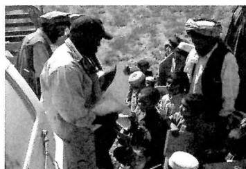
Distributing school supplies

We spent several evenings in the OR while small arms fire from AK-47s was directed towards our camp or in the bunker while 107mm rockets flew overhead. Fortunately those firing on our position were very poor shots and no one was hit.