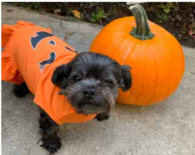
Sheba in her pumpkin dress.