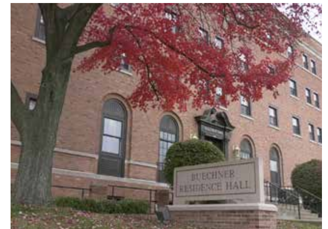
Buechner Hall pictured Oct. 30.