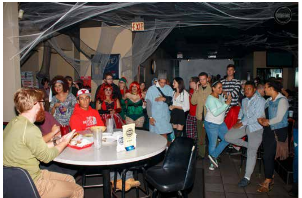
Photo from the annual Halloween Costume Contest hosted by the Department of Communication featuring YSU students in 2016.

Dr. Hill, 1350 Fifth Ave., near YSU campus, all insurances, walk-ins. Mon-Sat - 330-746-7007, askthedoctor@aiwhealth.com, answered confidentially.