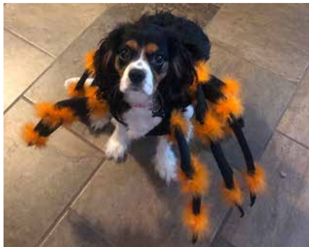
Luke pictured as a spider.