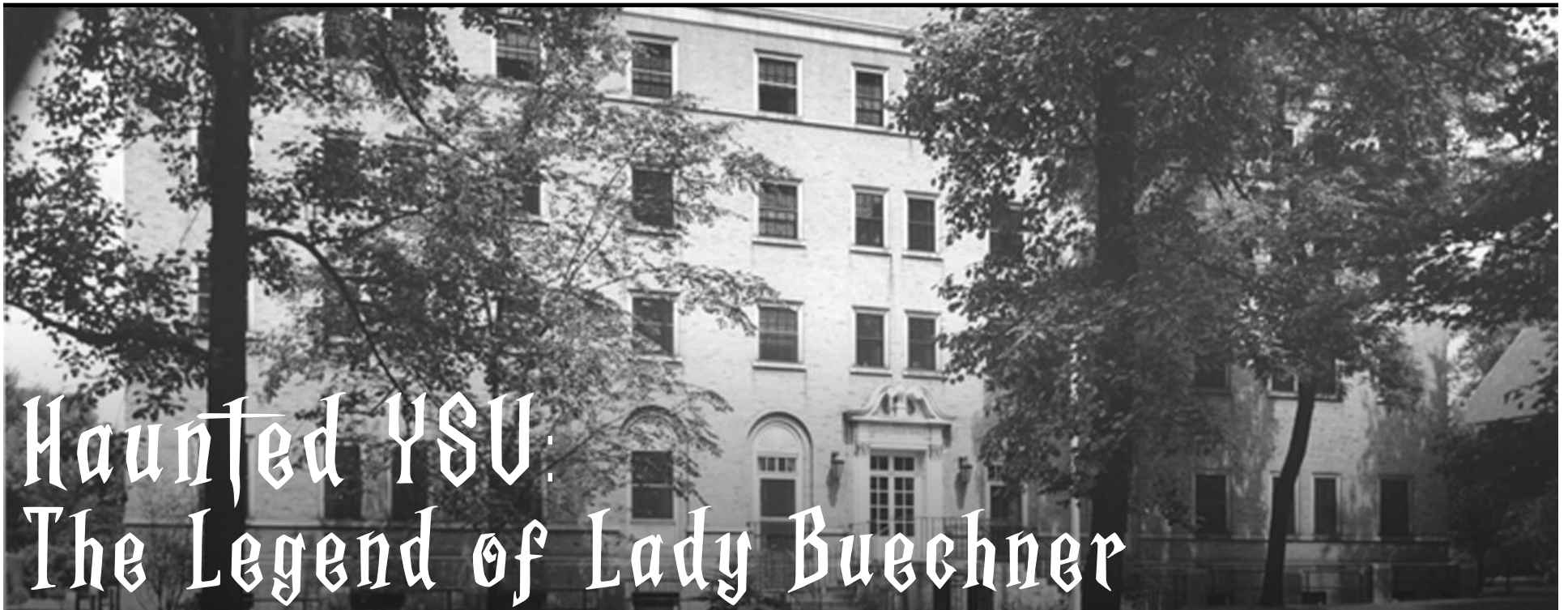
Buechner Hall pictured in 1943.