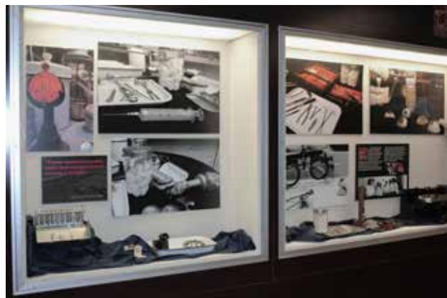
The “Extract and Augment” photo exhibit.