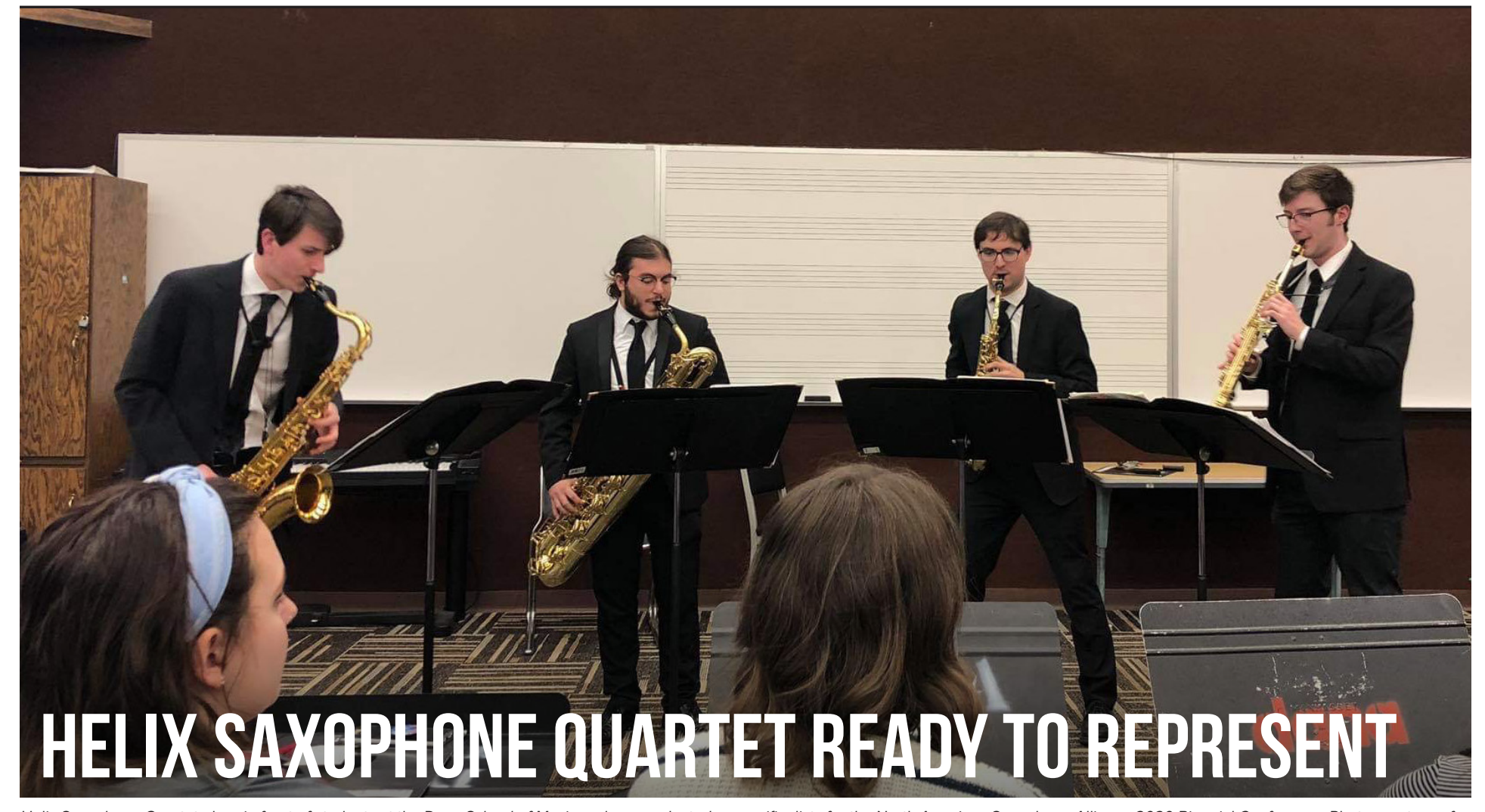
Helix Saxophone Quartet plays in front of students at the Dana School of Music and were selected as semifinalists for the North American Saxophone Alliance 2020 Biennial Conference.