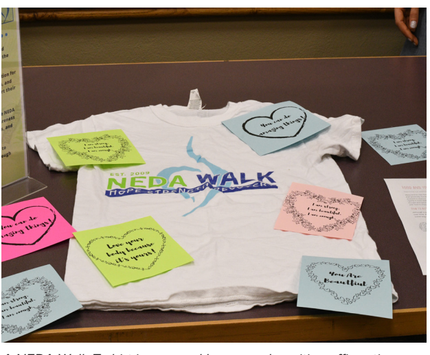
A NEDA Walk T-shirt is covered by several positive affirmation cards.

Other events, such as an "Exploring Your Relationships with Food" discussion and "Shop w/ the Registered Dietician" informing students on how to grocery shop on a budget, took place the week of Feb. 24.