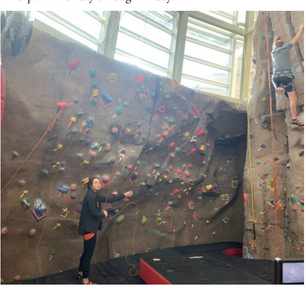
The Andrews Student Recreation and Wellness Center offers bouldering along with rock climbing.

Bouldering will be available in Mill Creek Park during regular park hours, while the rec center climbing wall is open 12-8 p.m. Monday through Friday.