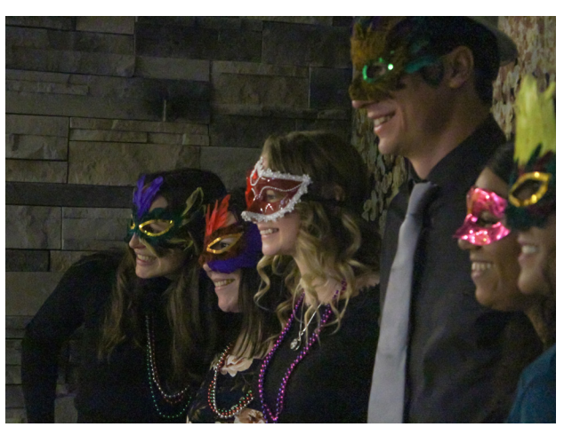
A group of party attendees smile for a photo during the student world language clubs Mardi Gras Masquerade Ball on Feb. 25 in Kilcawley Center.

"I wish there are more events like this, maybe a foreign film festival as well, where we have every club talking about a movie and explaining it and what it means to their culture and language studies," she said.