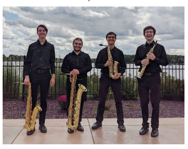
The Dana School of Music's Helix Saxophone Quartet was selected as a semifinalist for the North American Saxophone Alliance 2020 Biennial Conference in Tempe, Arizona on March 6-9.

The quartet members are looking forward to making their school, coach and themselves proud.