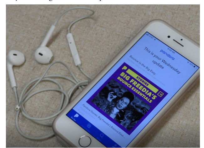
Buckeye Hospice and Palliative Care uses music therapy to help patients with dementia by playing their favorite songs through Pandora.

Music therapy benefits many Alzheimer's patients across the country. According to the Alzheimer's Association, music may reduce agitation and improve behavioral issues that are