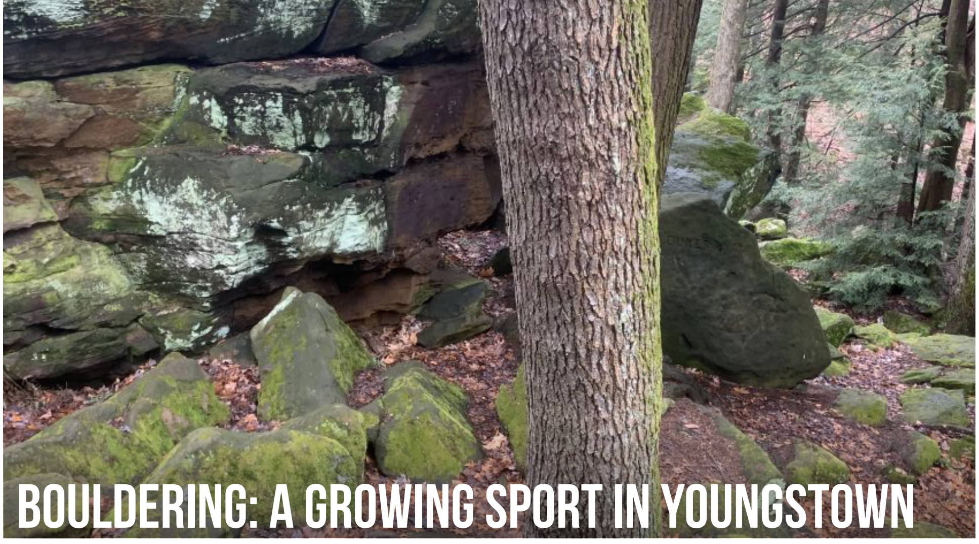
Bouldering was approved behind Bears Den Cabin in Mill Creek Park in November 2019.