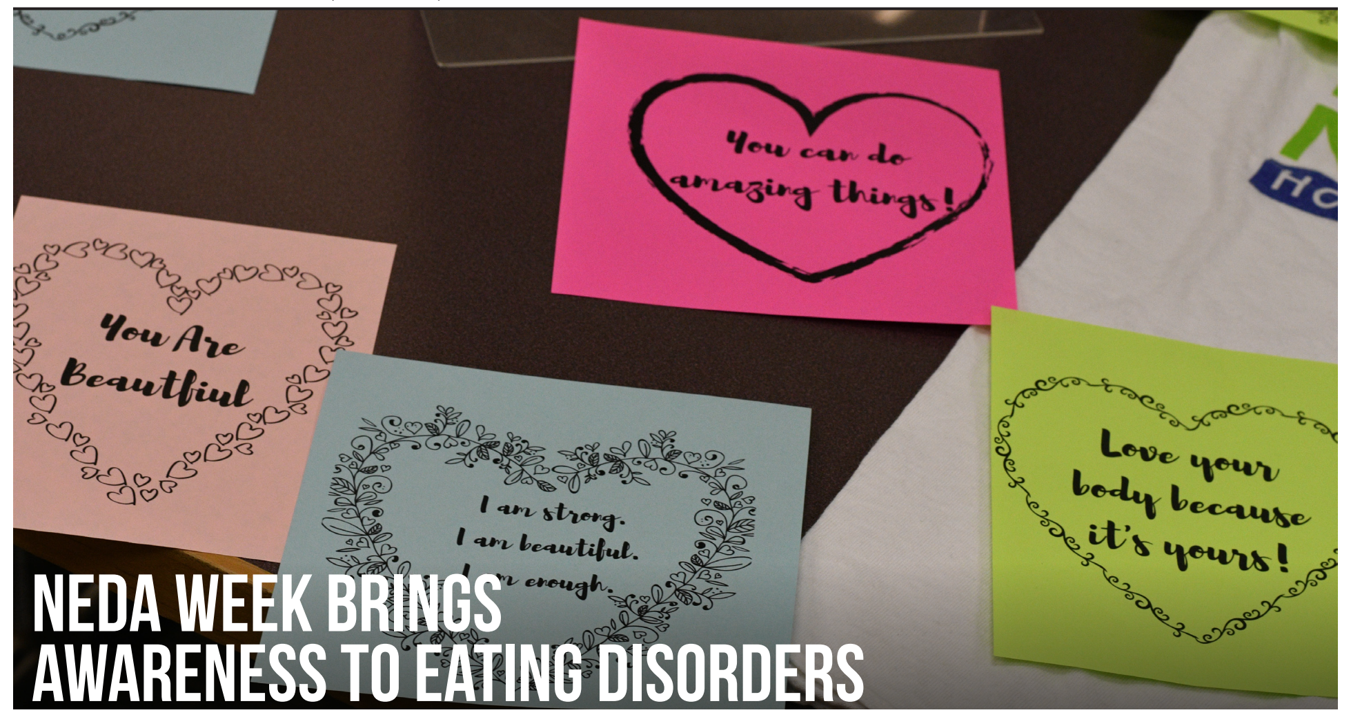
Positive messages are laid out on a table during a NEDA Week event.