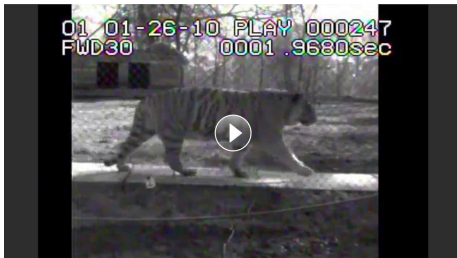
Video of tiger locomotion.