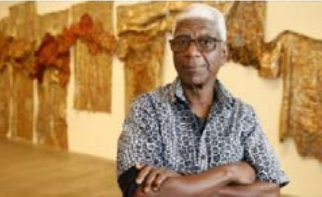
El Anatsui's art pieces use discarded items such as liquor bottle caps, printing plates and cassava graters. Photo courtesy of The McDonough Museum