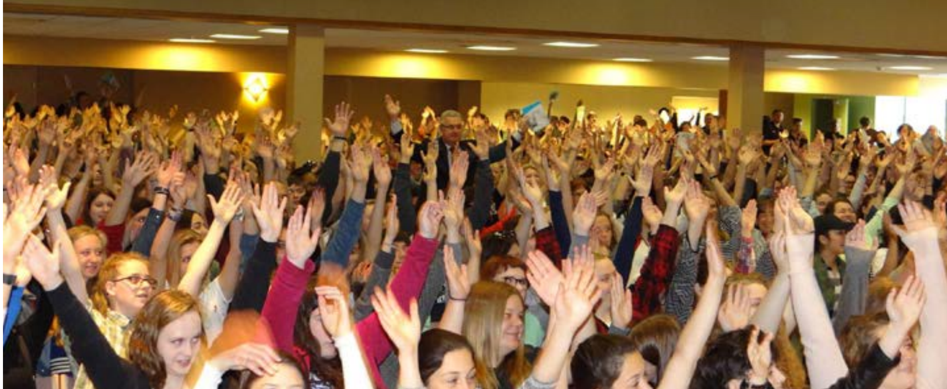
YSU President Jim Tressel and high school participants in the 2018 English Festival lift their hands to show their Y-pride. Volunteers can help students show off their pride virtually this year in April.