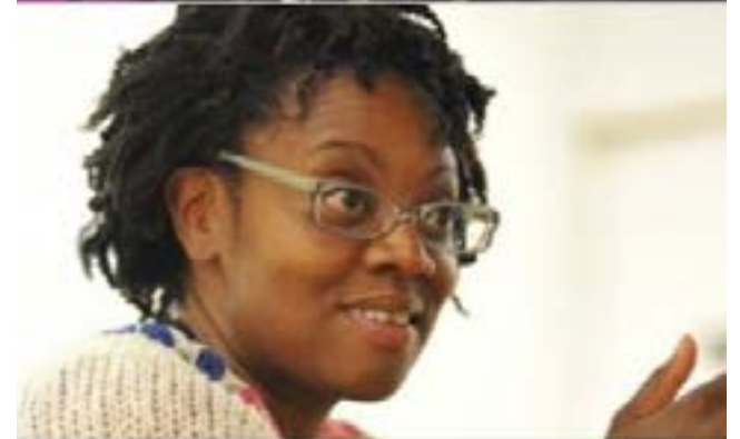
Cauleen Smith's art pieces reflect on the possibilities of imagination.