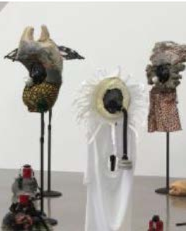
Kevin Beasley's art pieces are made from found materials and clothing, and reflect the bodies that may have once inhabited them.