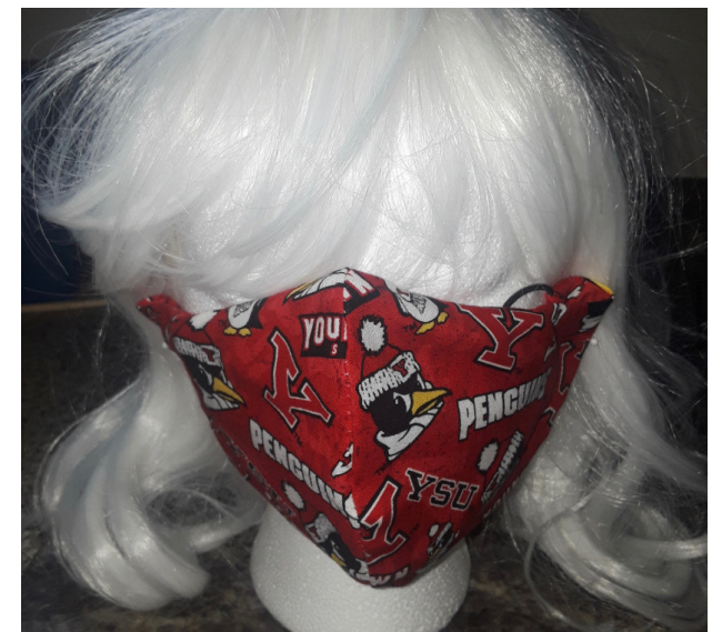
A mask Sally Frederick created to raise funds for veterans.

Jessica Neral, Samantha Neral and Frederick have used the new guidelines as an opportunity to make fashionable masks for good causes. Currently, they all still have masks for sale, available on the YSU app.