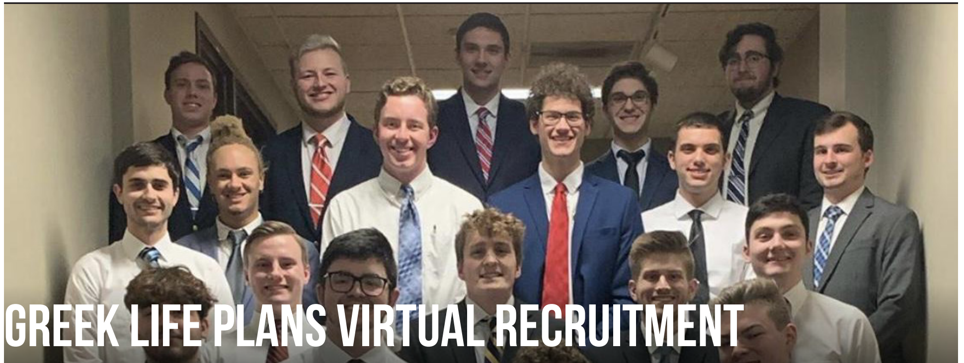
Members of Sig Tau Gamma fraternity in 2019 during recruitment.