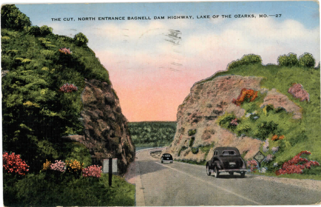
THE CUT, NORTH ENTRANCE BAGNELL DAM HIGHWAY, LAKE OF THE OZARKS, MO.—27