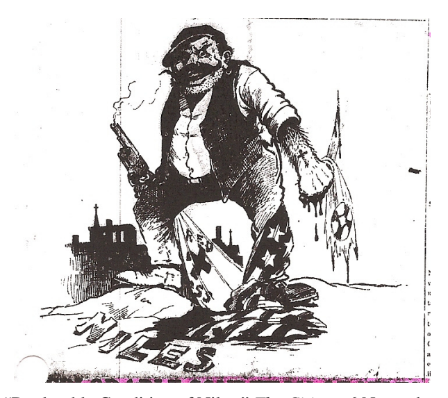
"Deplorable Condition of Niles," The Citizen, 6 November 1924, p. 1.

The Citizen believed that the Knights of the Flaming Circle deserved blame because, according to the Klan, the Flaming Circle was an anti-American association. Klansmen never realized that members of the Flaming Circle fought for rights they believed they held as American citizens.