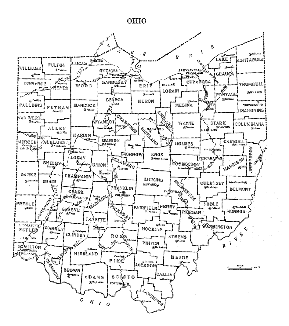
Fifteenth Census of the United States, Map, Population, 1930, Reports by states showing the composition and characteristics for counties, cities, and townships or other minor civil divisions, Vol. III, Part 2, Montana-Wyoming, retrieved from www.census.gov (Washington, D.C., 1932), 456.

surrounding towns and cities, was the location of several large steel mills.<sup>3</sup> Most of the business surrounding Niles was part of or associated with the iron or steel industry. The Niles Fire Brick Company, begun in 1872, produced firebrick used to line furnaces in the iron and steel industry. <sup>4</sup> All of these industries rose quickly and altered the landscape in which they existed.