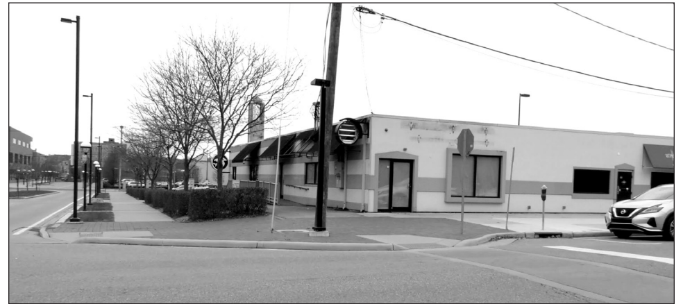
Where Jimmy John's used to serve sandwiches to the YSU community now sits an empty building.

In addition to restaurants closing around campus, many on-campus options have limited hours this semester. Many eateries in Kilcawley Center have cut their hours from previous semesters, such as Dunkin' Donuts, Wendy's and the KC Food Court. With the exception of Chick-fil-A, all other dining options in Kilcawley Center close by 5 p.m., with various options closing at 2 or 3 p.m.