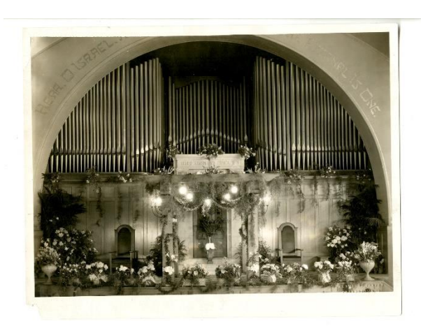
Congregation Rodef Sholom's bimah (1926)