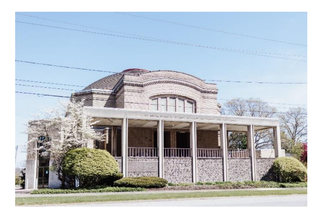
Congregation Ohev Beth Sholom (2022)