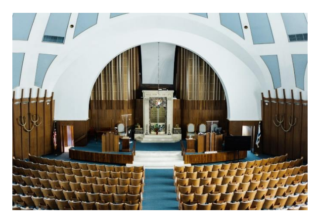
Bimah (2022) Congregation Rodef Sholom Archives