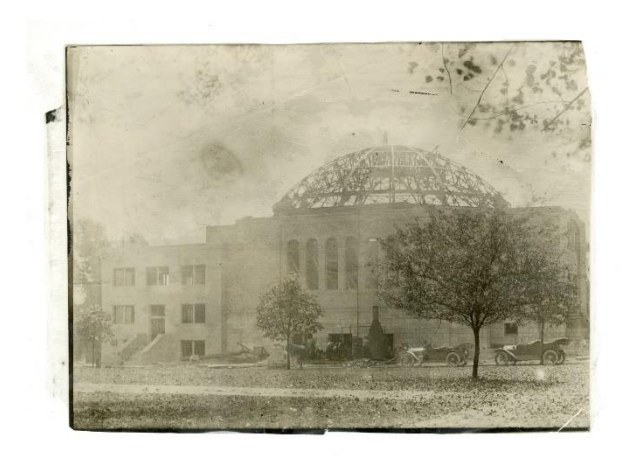
Construction of Congregation Rodef Sholom (1914)