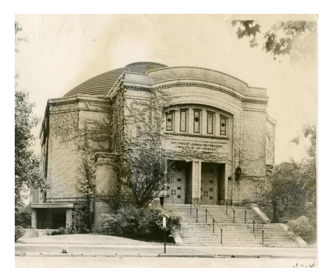
Congregation Rodef Sholom (circa 1950)