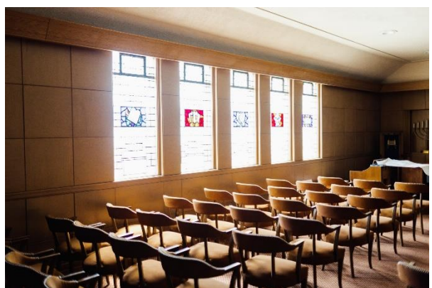
Tamarkin Chapel (2022) Congregation Rodef Sholom Archives

Ceiling of the Sanctuary (2022) Congregation Rodef Sholom Archives