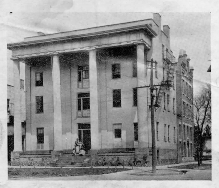
DANA'S INSTITUTE PROPERTIES.