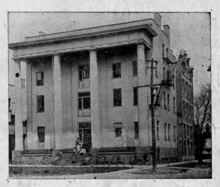
DANA'S INSTITUTE PROPERTIES.

One of the oldest and most influential schools of music in North America.