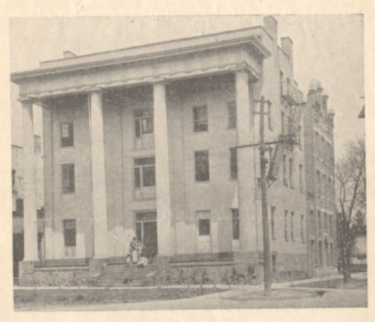
DANA'S INSTITUTE PROPERTIES.