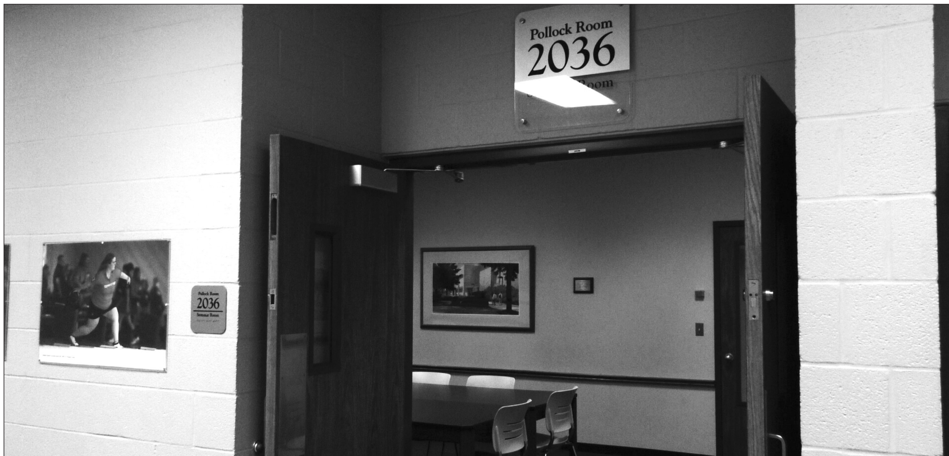
YSU for Recovery holds meetings in the Pollock Room of Kilcawley Center on Tuesdays.