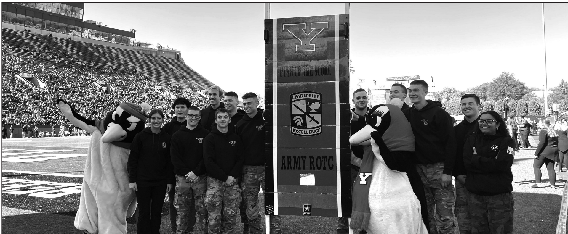
During football games, YSU ROTC leads school spirit activities.