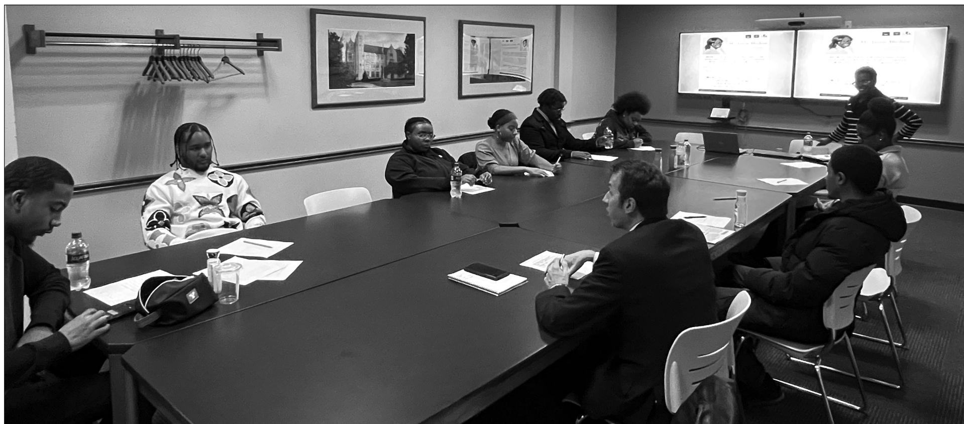
The BSU holds meetings in the Pollock Room of Kilcawley Center every other Wednesday.

For those interested, the Black Student Union holds its meetings every other Wednesday at 5 p.m. in the Pollock room of Kilcawley Center. More information can be found on the Black Student Union website.