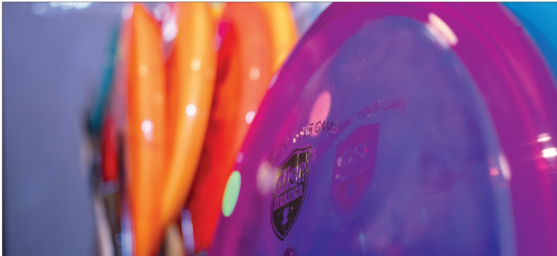
Youngstown Disc Golf Club's Winter Putting League offers a way to stay active during the cold season.