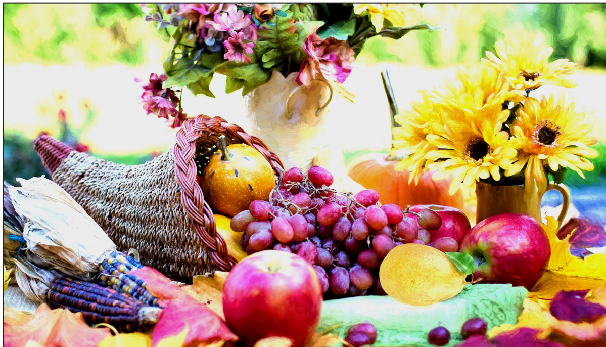
Cornucopias are widely used to symbolize Thanksgiving.