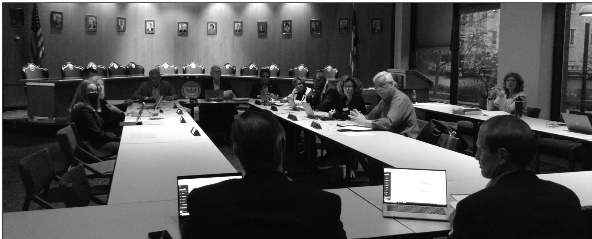
Continuing cuts? Board of trustees calls special meeting before December decisions.

The next board of trustees meeting is scheduled for Dec. 9 in Tod Hall at 10 a.m. following the Dec. 8 individual committee meetings.