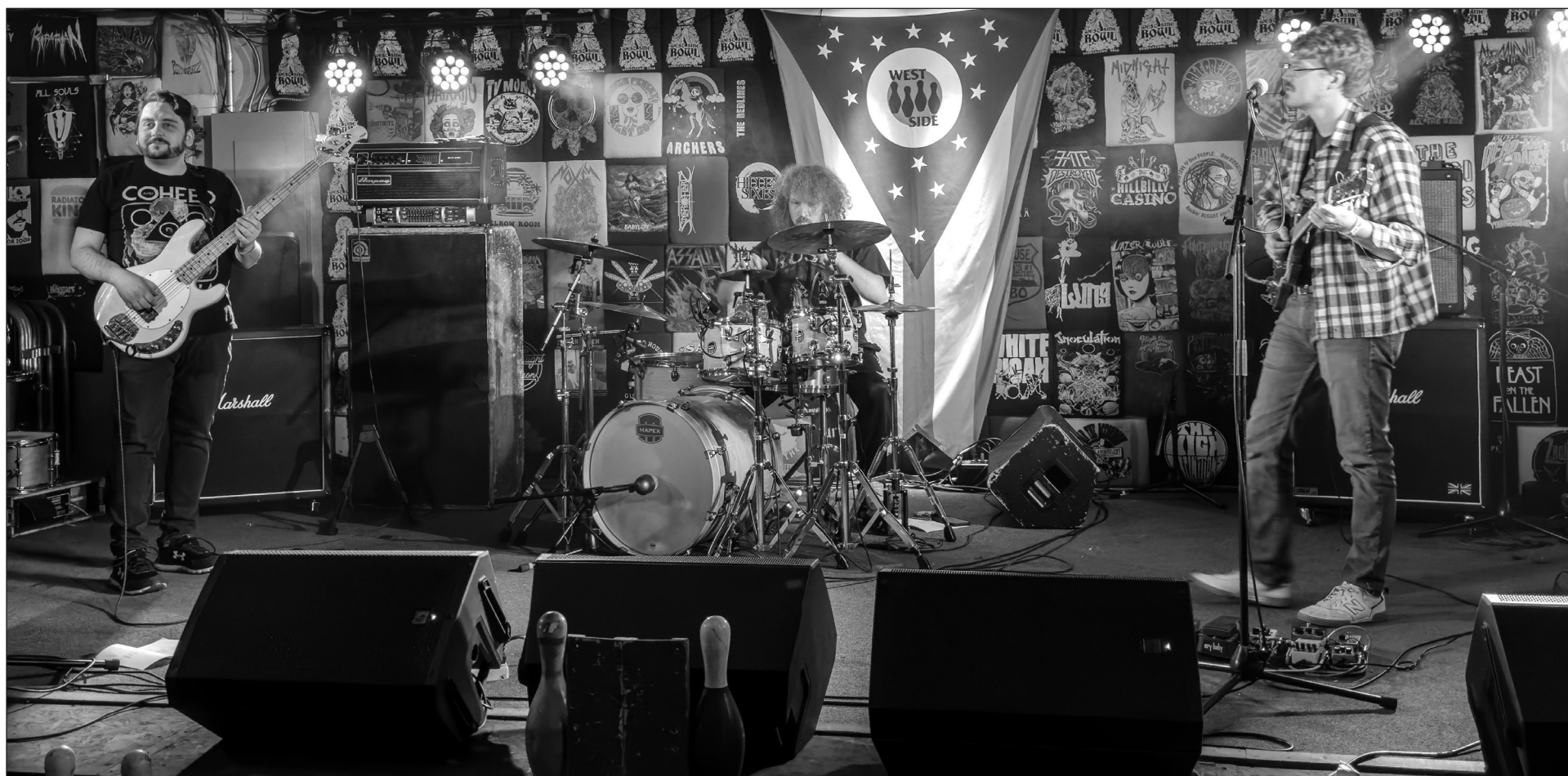
Speedo Agreedo performs in Westside Bowl’s basement.

Speedo Agreedo’s album is available to be streamed on Spotify and Apple Music. It will play its next show at Westside Bowl with the band Sedona on Jan. 14.