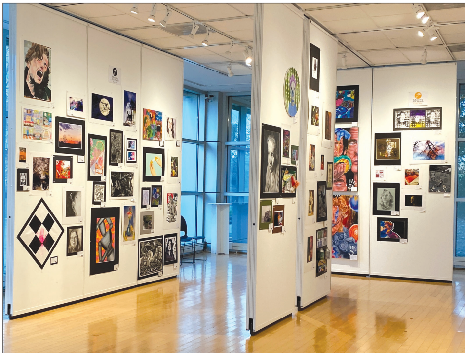
The Solomon Rae Gallery is decorated with high school students’ artwork for the Scholastics Art Exhibition.

An award ceremony will take place at 11 a.m. on Jan. 28 in the Ford Theatre of Bliss Hall. The event will have speakers from YSU, Akron Children’s Hospital and Boardman Rotary Club to talk about the student’s accomplishments. The Butler Institute of American Art will have a small reception.