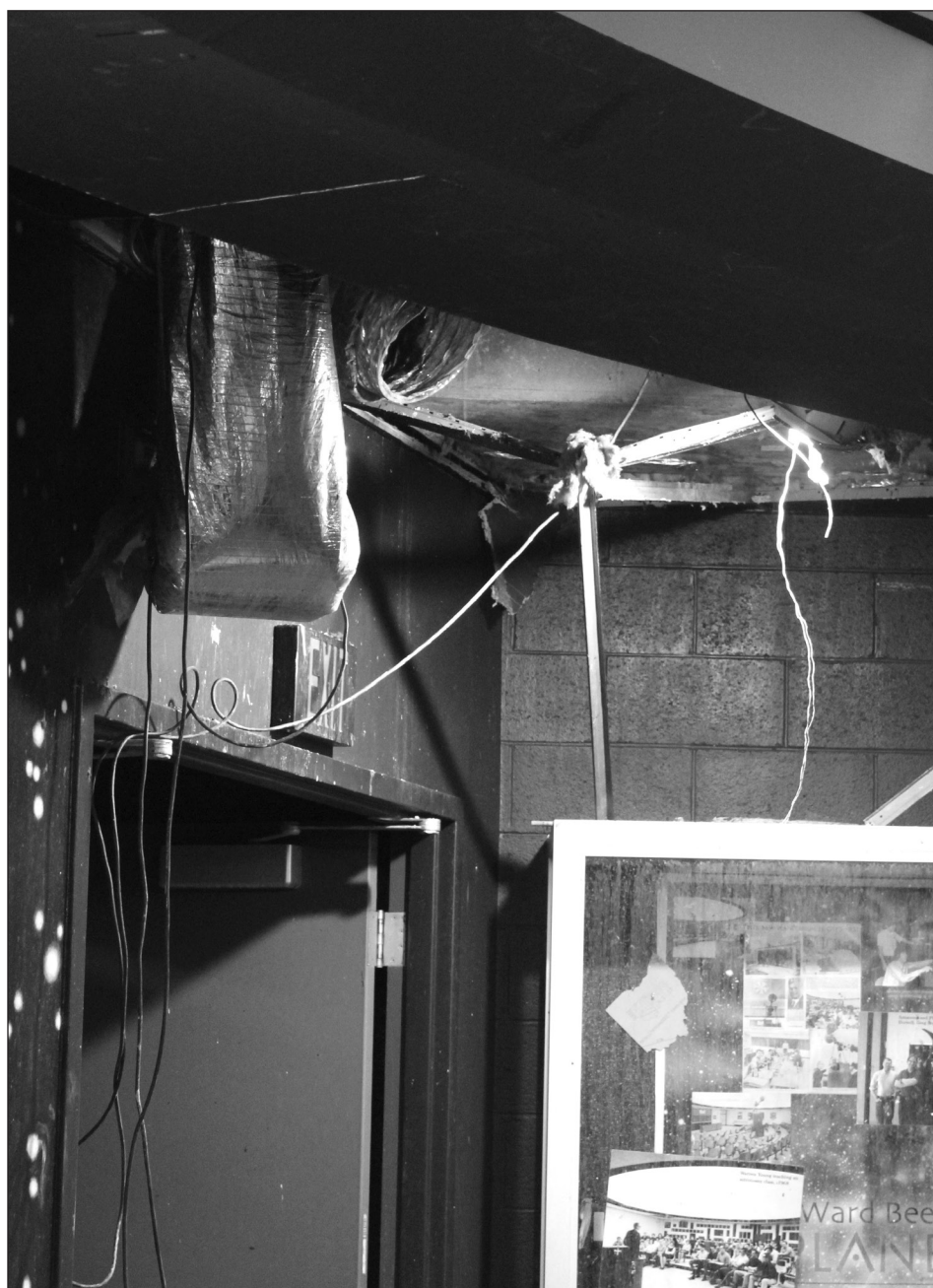
Damage is visible inside and outside of the planetarium.

Ward Beecher Hall reopened for students on Jan. 10, but it's still uncertain what the future will be for the Ward Beecher Planetarium as it will remain closed until further notice. For more updates, head to the planetarium's Facebook page.