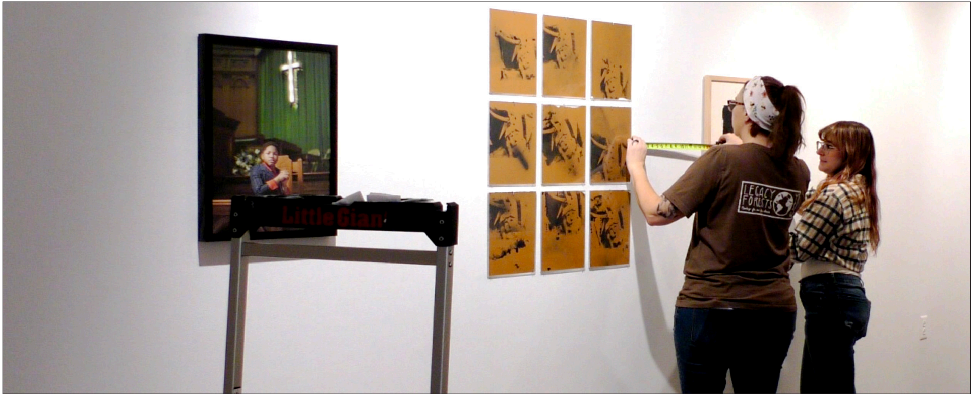
Student employees set up art exhibits for the spring 2023 semester.