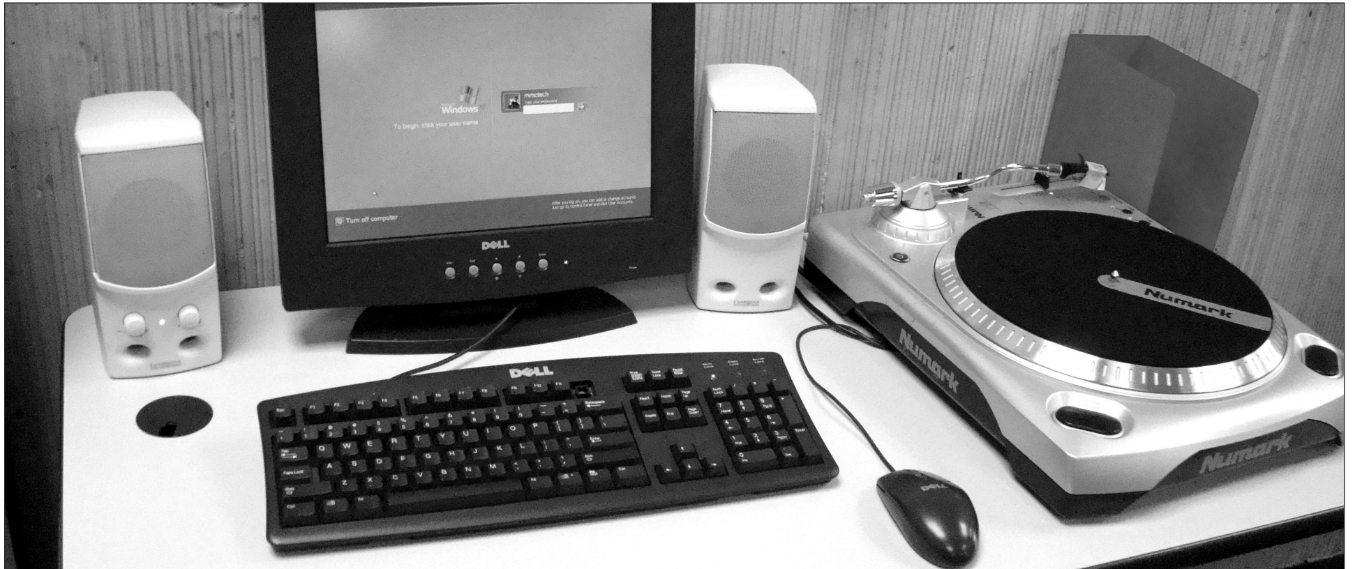
The multimedia center at Maag library, which stored vinyl, CDs and DVDs, was also downsized after its subject specialist retired.