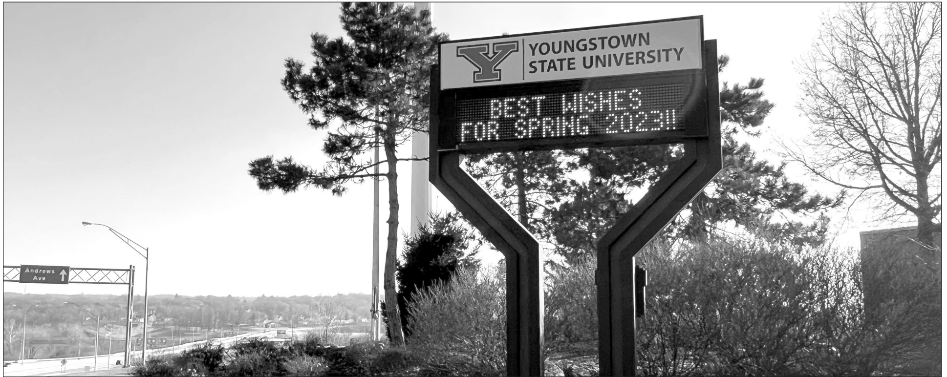
Youngstown State University encourages bypassers and students to have a successful spring semester.