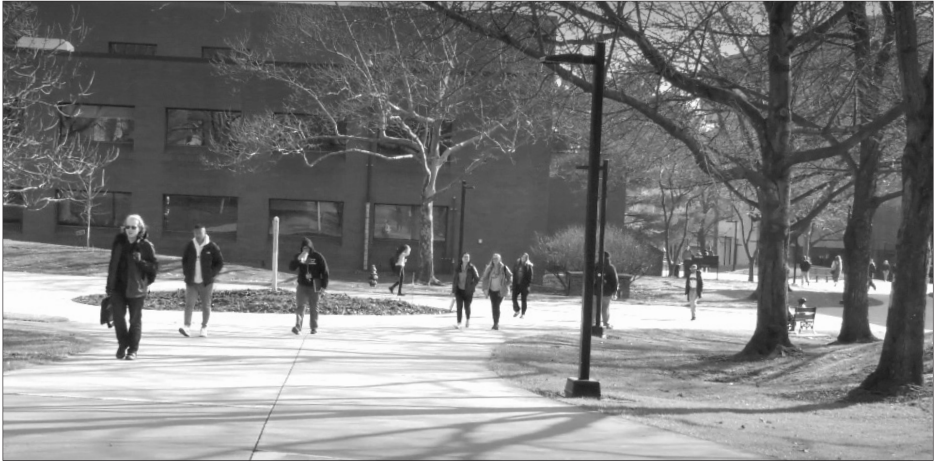
Spring semester starts for YSU students, staff and faculty.