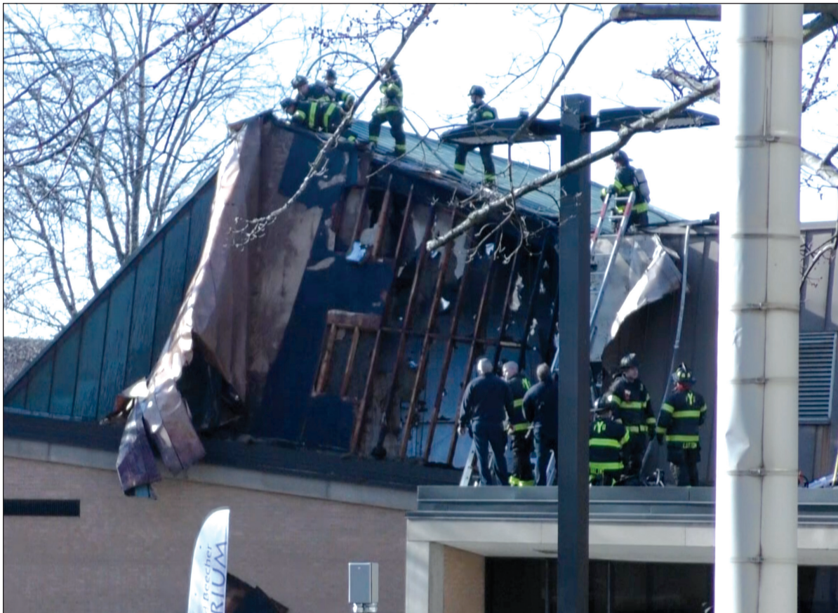
Fire crews battle fire at Ward Beecher Planetarium.