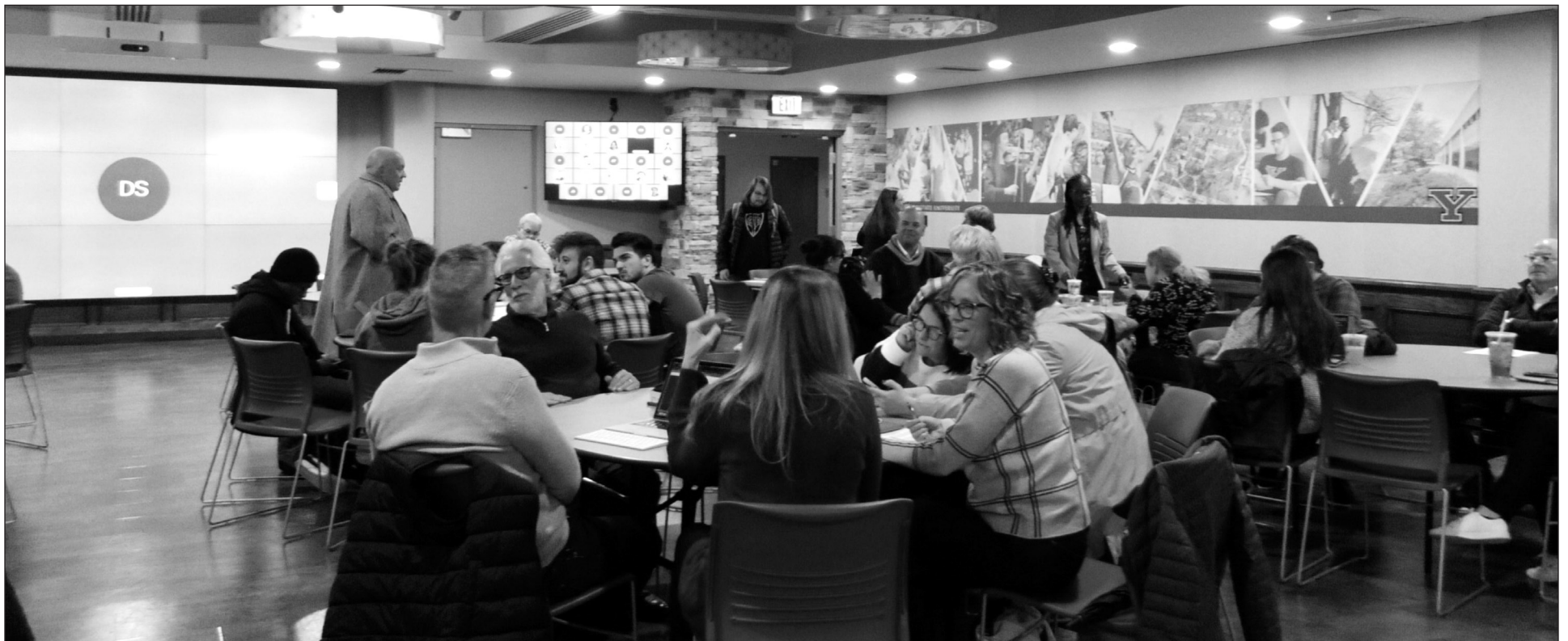
YSU Academic Senate Committee gather to discuss the new General Education program.

Certificate course proposals are currently open for submission, the programs and courses will be listed by Feb. 17. More information can be found regarding the proposed certification program at YSU's Gen Ed Program website.