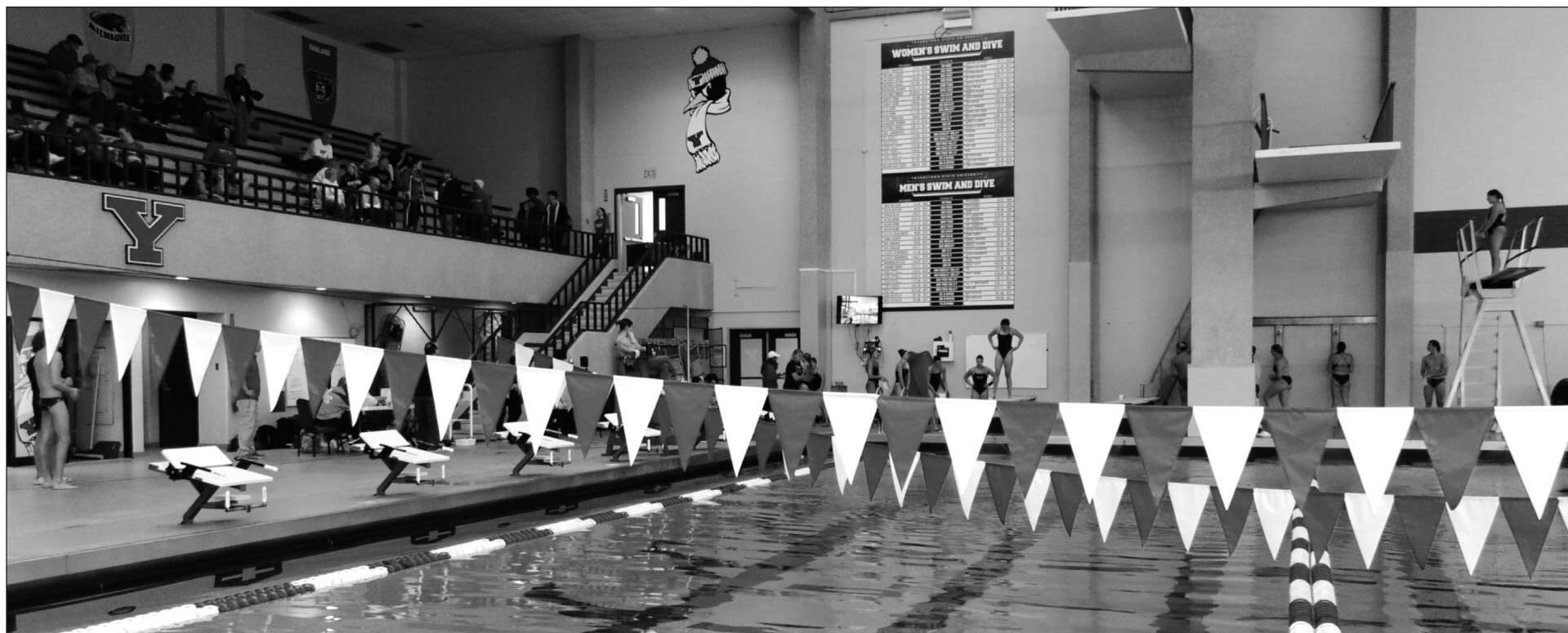
The swimming & diving team hosted Niagara University and Duquesne University.