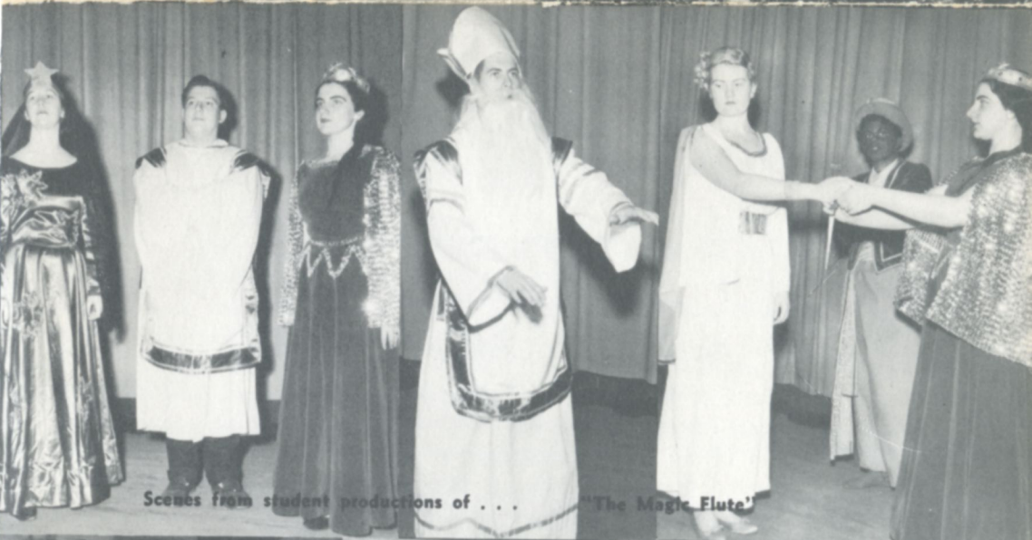
Scenes from student productions of . . . "The Magic Flute"