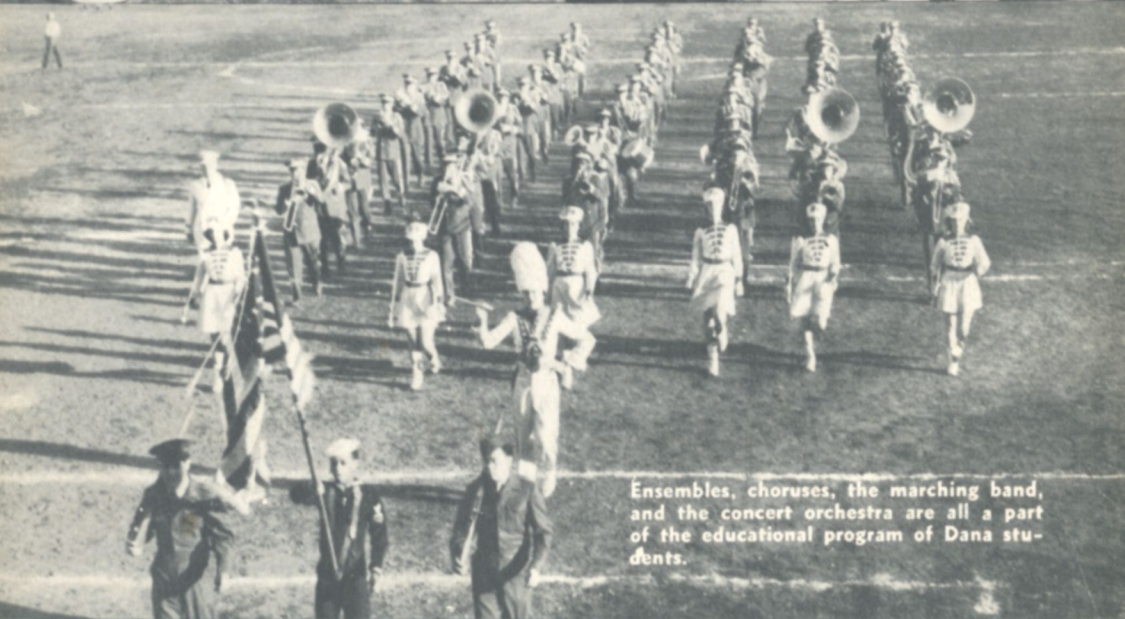
Ensembles, choruses, the marching band, and the concert orchestra are all a part of the educational program of Dana students.