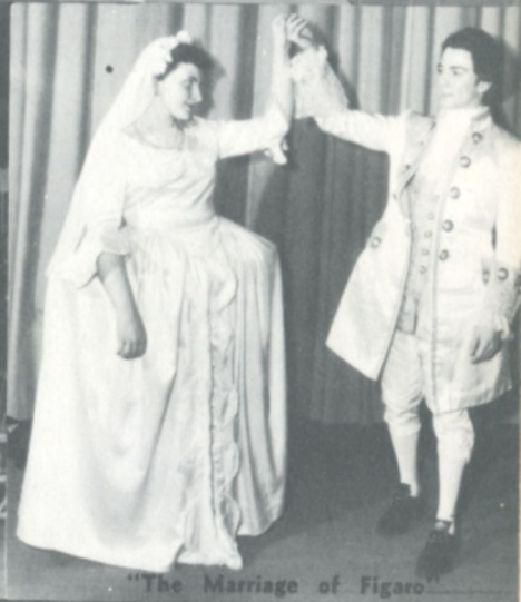
"The Marriage of Figaro"