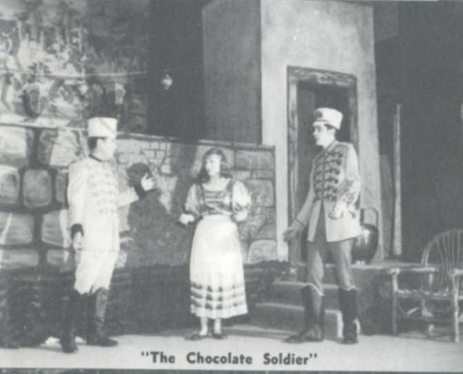
"The Chocolate Soldier"