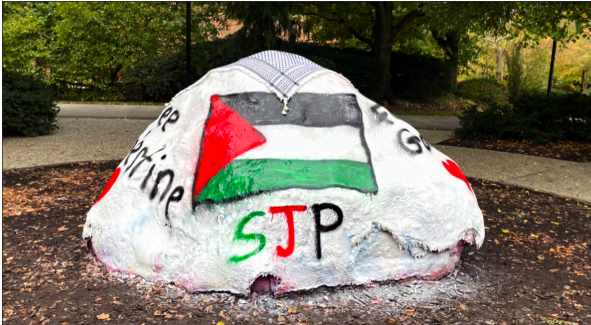
The rock was painted by the Students for Justice in Palestine.