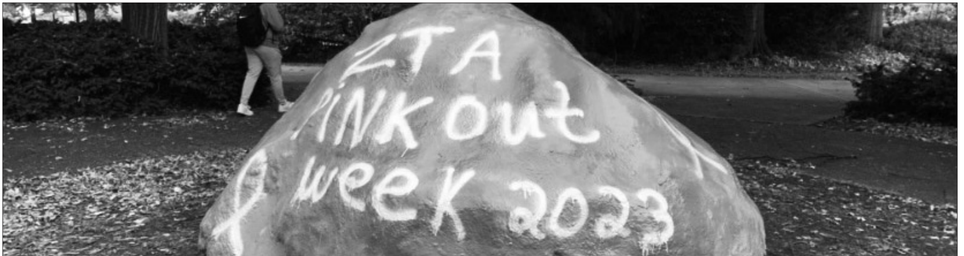
Zeta Tau Alpha painted the rock in honor of Breast Cancer Awareness Month.

Students interested in Zeta Tau Alpha's fundraiser can visit the link found on its instagram @deltazeta_ysu. Students who want to learn more about breast cancer awareness month can visit its national website.