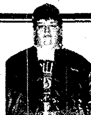
Charlie Deitch Photo Editor

It made me mad, real mad. It really hurt when the United States Supreme Court ruled a few weeks ago that "hate crimes," for example cross burning and Nazi flag waving, cannot be outlawed by individual state and local governments.