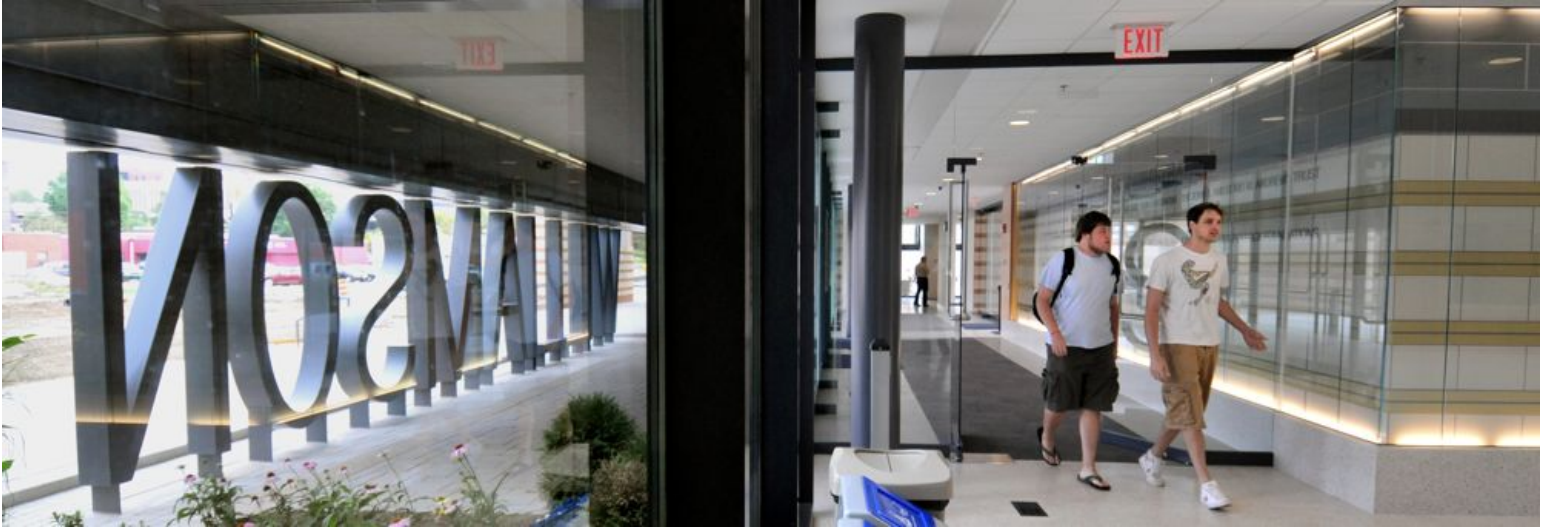
Students enter the new Williamson Hall on the first day of classes.