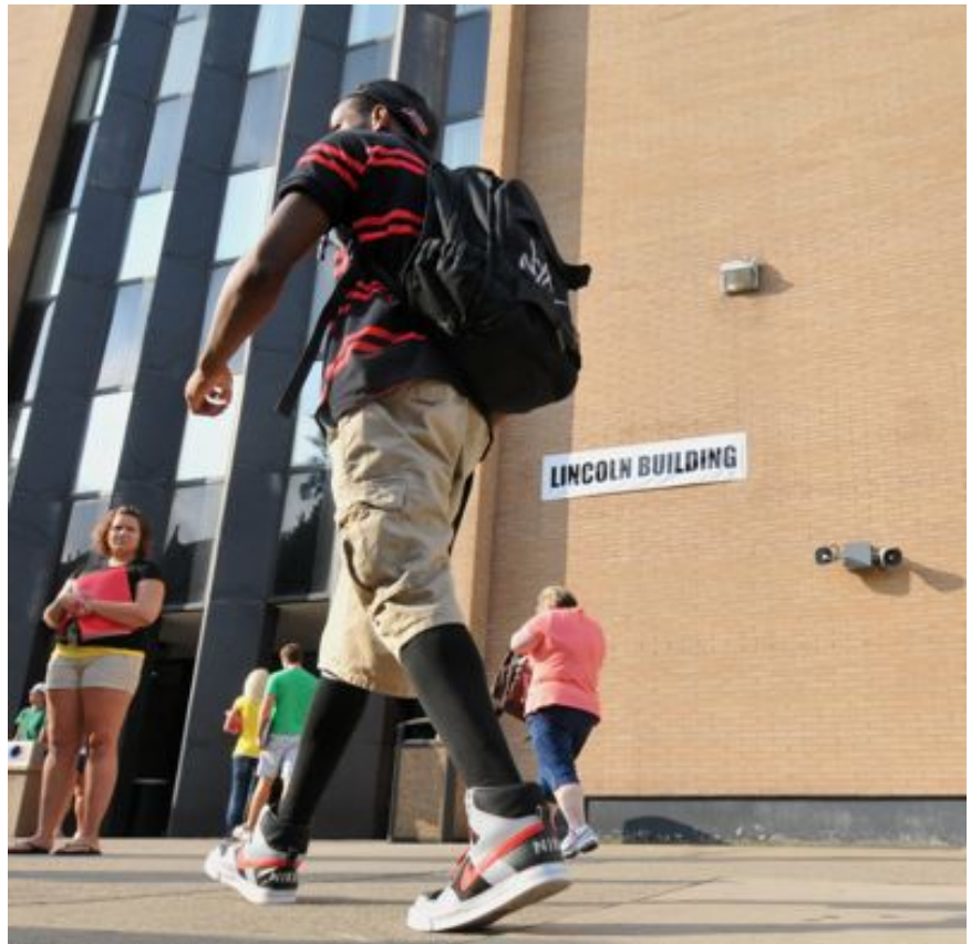
The old Williamson Hall has been renamed the Lincoln Building.