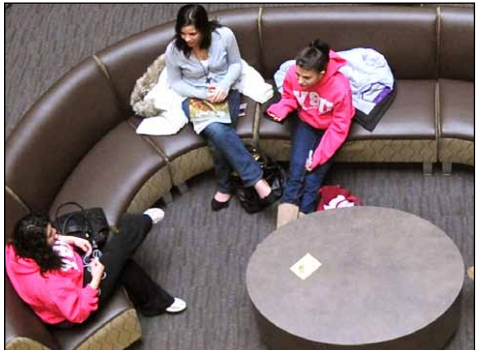
Students relax in the newly renovated student lounge in the atrium of Cushwa Hall.

"There are still a lot of projects that need to be addressed," Sacco said. "We will continue to meet, identify projects and complete them as the funds become available." ■