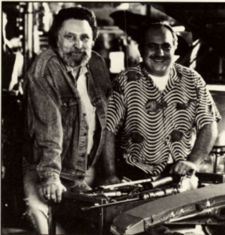
Tom and Ray Magliozzi, hosts of Car Talk from National Public Radio. Aired Saturday morning at 10:00.