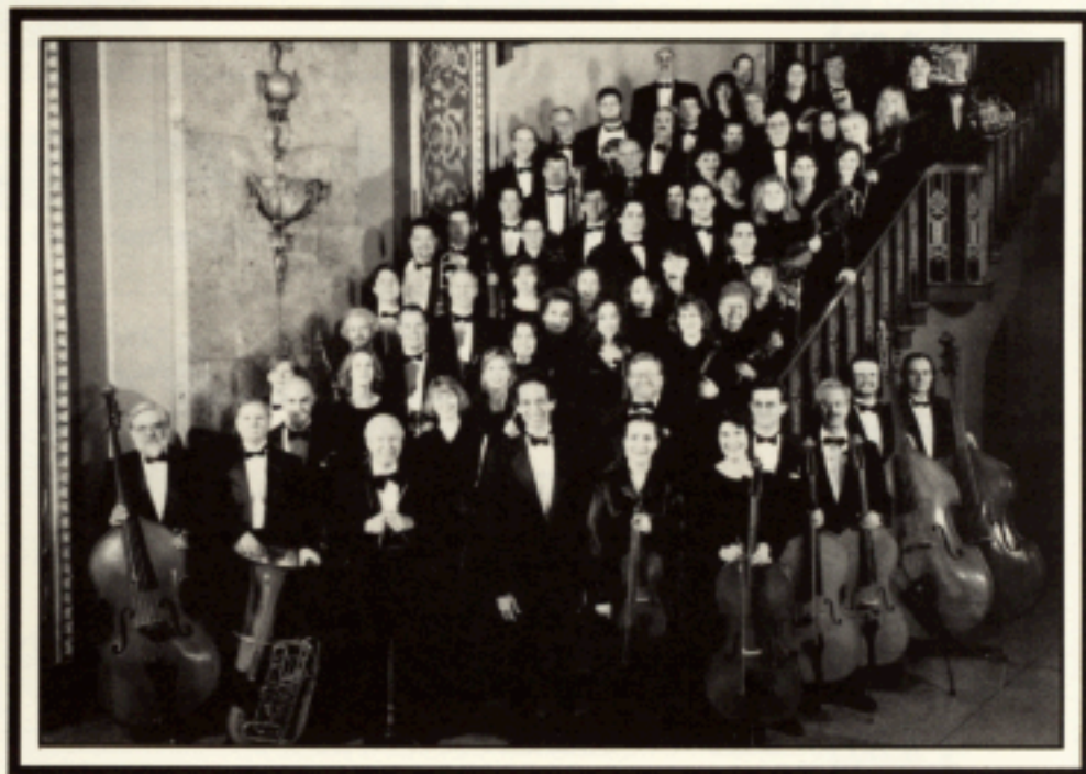
Youngstown Symphony Orchestra