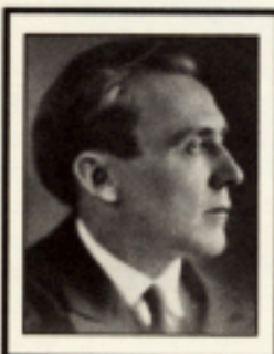
American symphonic composer Roy Harris.

This year marks the centennial of composer Roy Harris, one of the most important figures in the establishment of an American symphonic music. His first symphonies, especially the Third of 1939, created a sensation for their vivid power and unabashed exuberance. American themes dominated Harris's creative output, which eventually totaled more than 200 works.