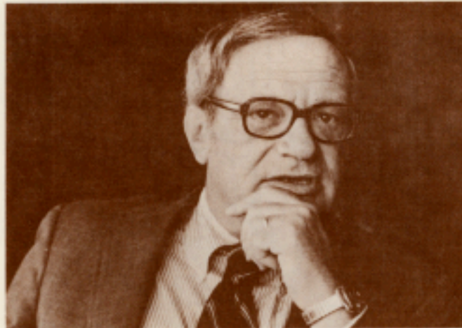
FRANK MANKIEWICZ President, National Public Radio