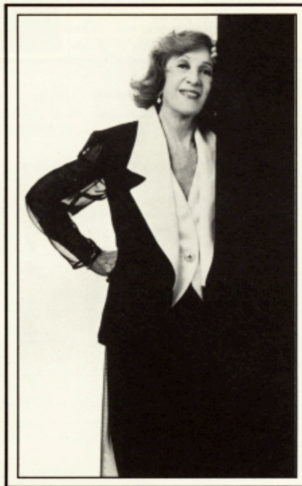
Marian McPartland, host of Marian McPartland's Piano Jazz , on the air every Friday night at 11:00.

8/29 Matt Dennis. Matt Dennis arranged songs for Tommy Dorsey in the 1940s and played with the Glen Miller Orchestra for a brief time during WWII. He joins McPartland for "Let's Get Away from It All," and then solos on his own tune, "Violets for Your Furs."