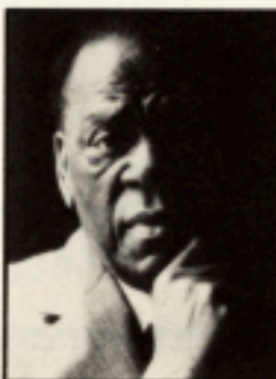
Singer William Warfield provides critical commentary in Classically Black: Robeson! Thursday, February 26th at 11:00 am.