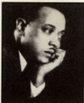
William Grant Still is one of many composers featured on Beyond Joplin: A Celebration of Black Classical Music , airing Thursdays at 11:00 am, February 5th, 12th, and 19th.