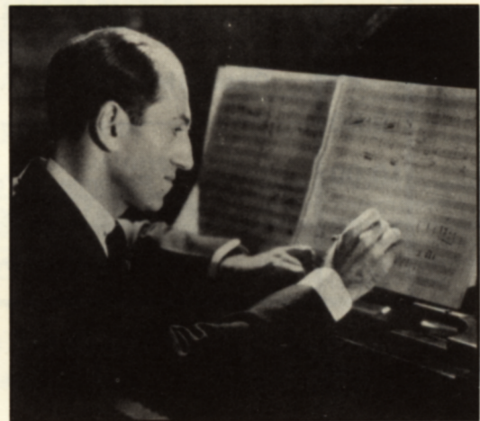
George Gershwin finishing Porgy and Bess , August, 1935.