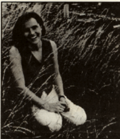
Fiona Ritchie, host of The Thistle & Shamrock , which airs Sunday evenings at 7:00 pm.