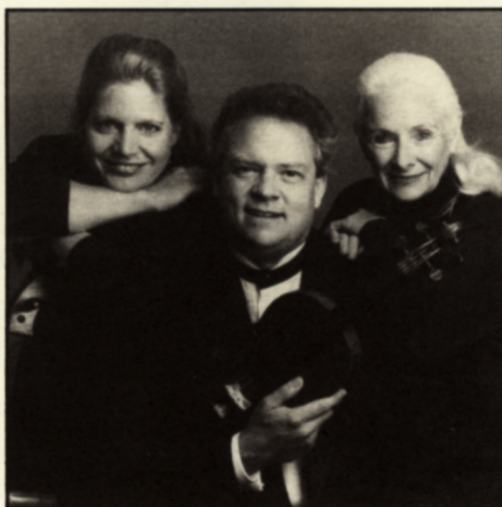
The Eaken Piano Trio will be performing on Friday, October 8 at 8:00 pm in the Bliss Recital Hall.

WYSU-FM celebrates 30 years of broadcasting this October, and part of the celebration will include an appearance by the highly acclaimed Eaken Piano Trio, sponsored by WYSU-FM and YSU's Dana School of Music. The Eaken Piano Trio is a professional ensemble committed to the performance and enrichment of chamber music through concert appearances, recordings and educational programs for students of all ages. They have performed extensively across the United States, Europe and Canada, and they also maintain a busy recording schedule as well. In 1996 the ensemble's holiday radio program, Home for the Holidays , was heard on more than 150 stations nationwide, and that successful reception prompted its release on compact disc. That album is one of the group's eight CDs, all of which are currently available.