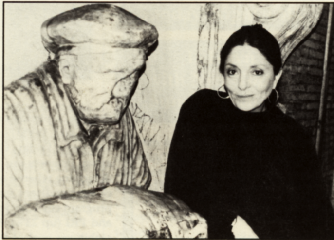
Sylvia Poggioli, NPR correspondent, based in Italy.