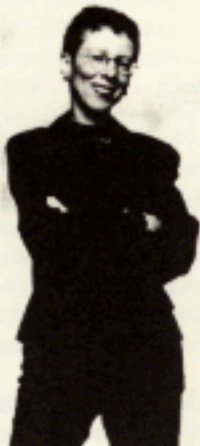
Terry Gross, host of

Some special concerts commemorating the season of Advent are scheduled throughout the first few weeks of December, with renowned groups such as the National Lutheran Choir and the St Olaf Festival Choir offering some fresh new arrangements along with some beloved perennials this year. Of course there will be the obligatory favorites such as Handel's Messiah , scheduled for Friday morning, December 21, and the Festival of Nine Lessons and Carols from King's College Chapel at 10 am on Christmas Eve. These are just a few samples of what's in store; there's more detailed information inside.