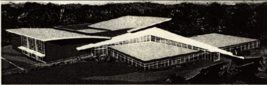
Davis YMCA Wellness Center in Boardman