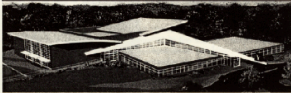
Davis YMCA/Wellness Center in Boardman