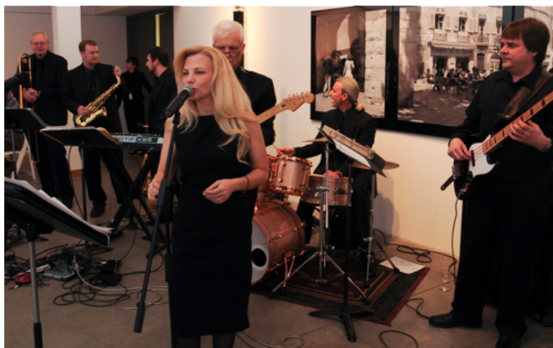
Second Avenue Project performs at this year's Mad About the Arts at the McDonough Museum of Art.

The evening begins with a Friends of the Arts Preview at 6:30 p.m., followed by the Main Celebration at 7:30 p.m. Featured performers for the Friends Preview is the Second Avenue Jazz quartet. Performing at the Main Celebration will be the Second Avenue Project.