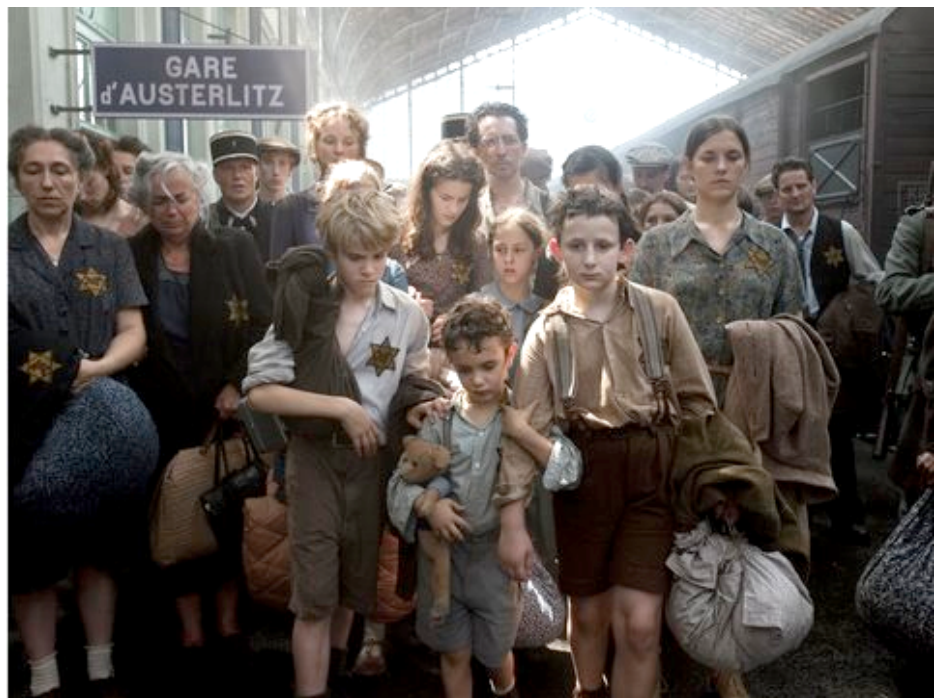
La Rafle is one of the movies featured in this year's Jewish Film Festival.

Winner of 10 Film Festival Audience Awards, La Rafle takes place in France's Montmartre and recreates the Nazi regime's imprisonment of 13,000 Parisian Jews during 1942, as shown from the perspective of three Jewish children and their parents.