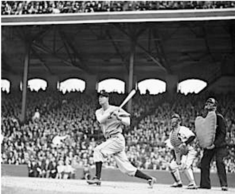
Jews and Baseball: An American Love Story

When one Russian conductor prodigy during the Communist regime refuses to dismiss Jewish musicians from the Bolshoi Orchestra, he gets ousted, taking on a new role as janitor for the Bolshoi instead. Thirty years later, he wants to get even. Reuniting with his rag-tag and scattered old musician friends, he pretends to be the Bolshoi and sneaks a performance at a prestigious Paris concert. Le Concert won Best Score at the 2010 Cesar Awards.