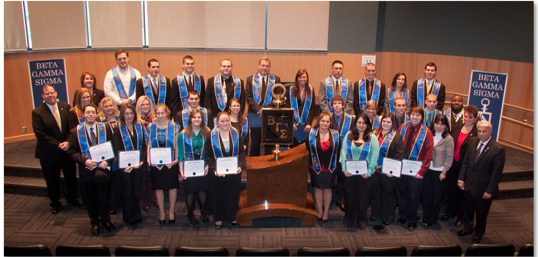
Forty-one students in the YSU Williamson College of Business Administration were installed recently into Beta Gamma Sigma honorary.

Beta Gamma Sigma is the world's premier business honorary reserved exclusively for schools accredited by the Association to Advance Collegiate Schools of Business. While nearly 350,000 students receive bachelors or master's degrees in business each year, only about 25,000 are inducted into a lifetime membership in Beta Gamma Sigma. Students must be registered in business administration programs for baccalaureate or MBA degrees and must rank in the top 10 percent of the junior class, the top 10 percent of the senior class or the top 20 percent of the master's program.