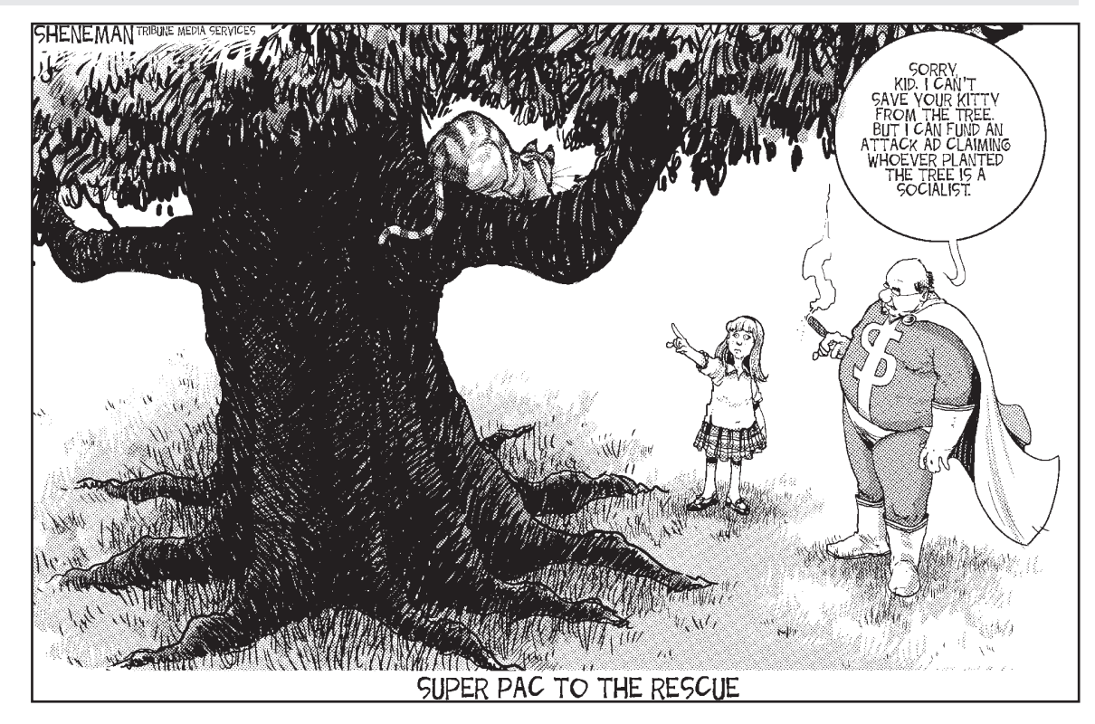
The views of this artist do not necessarily agree with those of The Jambar.