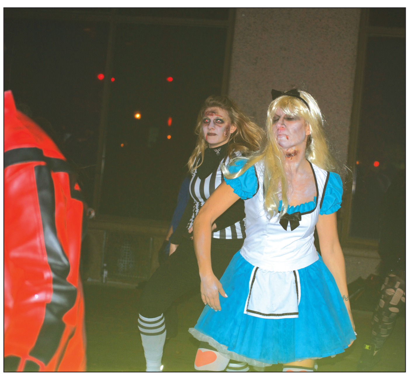
Dressed as zombies, Youngstown residents dance to Michael Jackson's "Thriller" on Saturday night.