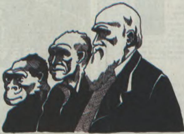
MGT CAMPUS ILLUSTRATION