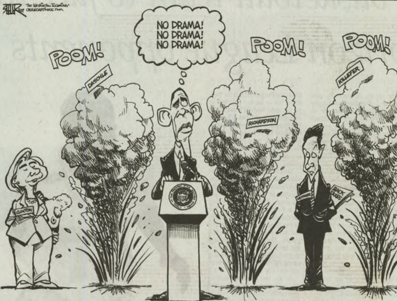
The views of this syndicated artist do not necessarily agree with those of The Jambar.