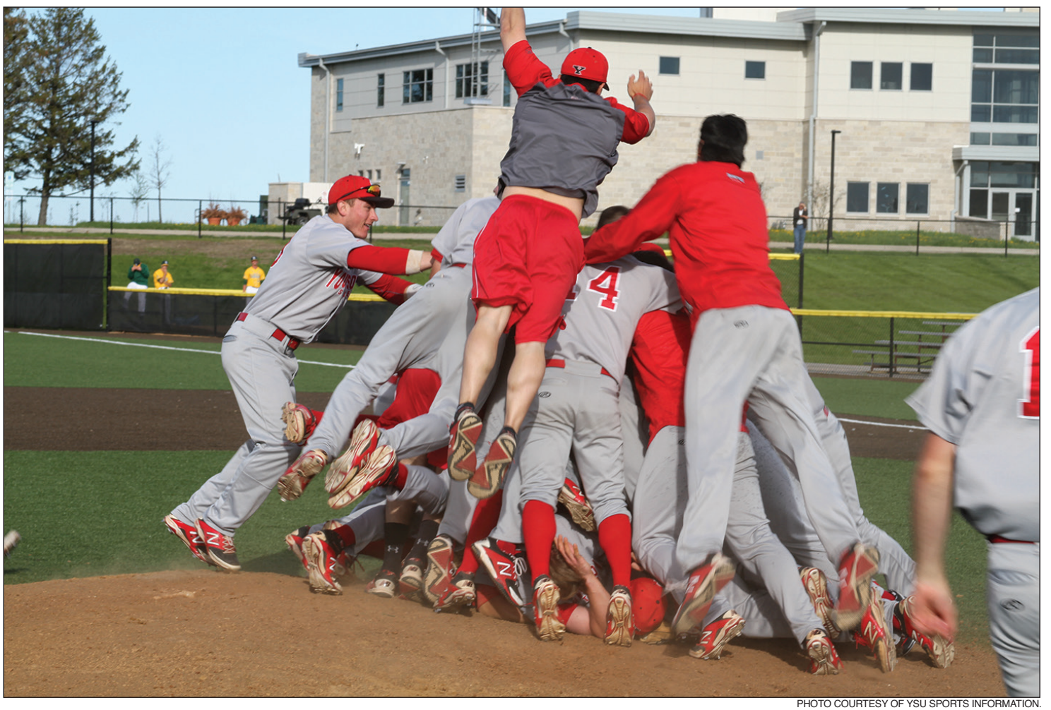
Although the YSU baseball team is just 136-305 since 2007, the Penguins won the Horizon League tournament (celebrating above) and an NCAA Regional game to close the 2014 season. In turn, the program has received a significant boost in its rebuilding plan, which began in July 2012.

That surge of interest in YSU baseball began last June.