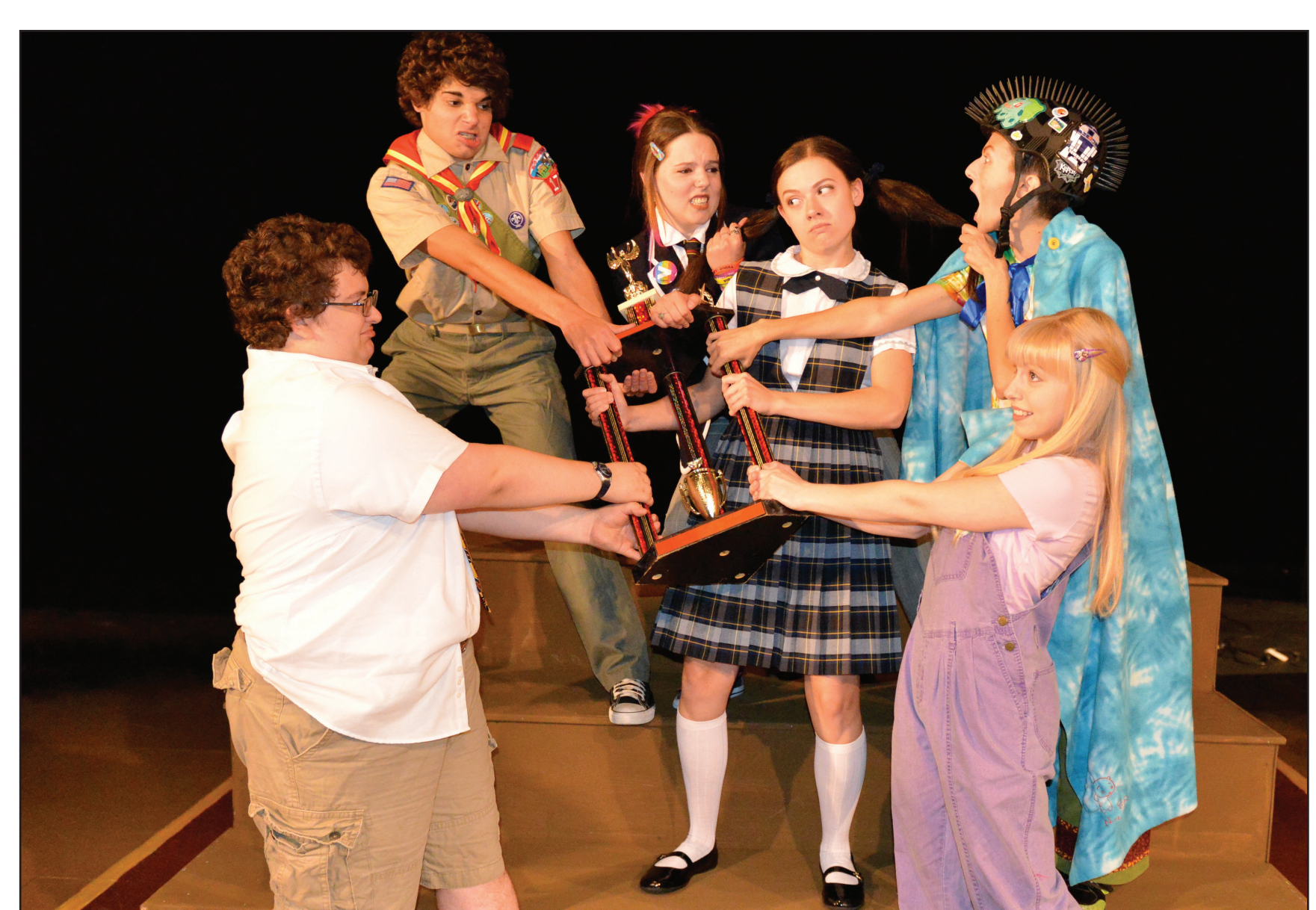
"The 25th Annual Putnam Spelling Bee" opens the Youngstown State University Theater's season this Friday. The production is centered on six students as they compete for a chance to go to the national spelling bee championships.