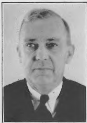
Dr. Ralph M. Waters