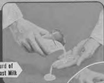
Curd of Breast Milk