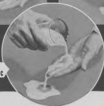
Curd of SIMILAC