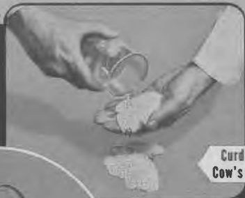
Curd of Cow's Milk