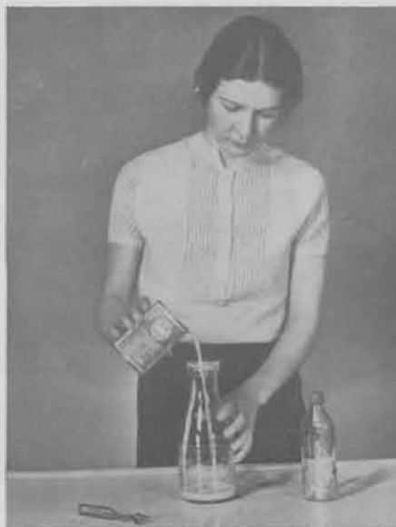
1. Empty one can into a quart milk bottle.