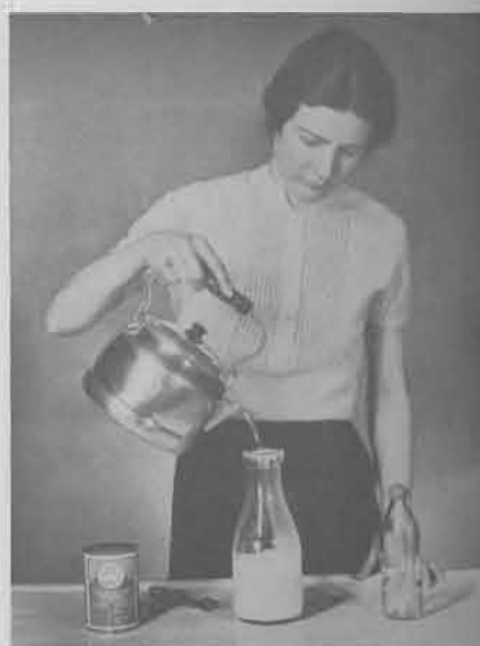
2. Fill with cold boiled water and mix.