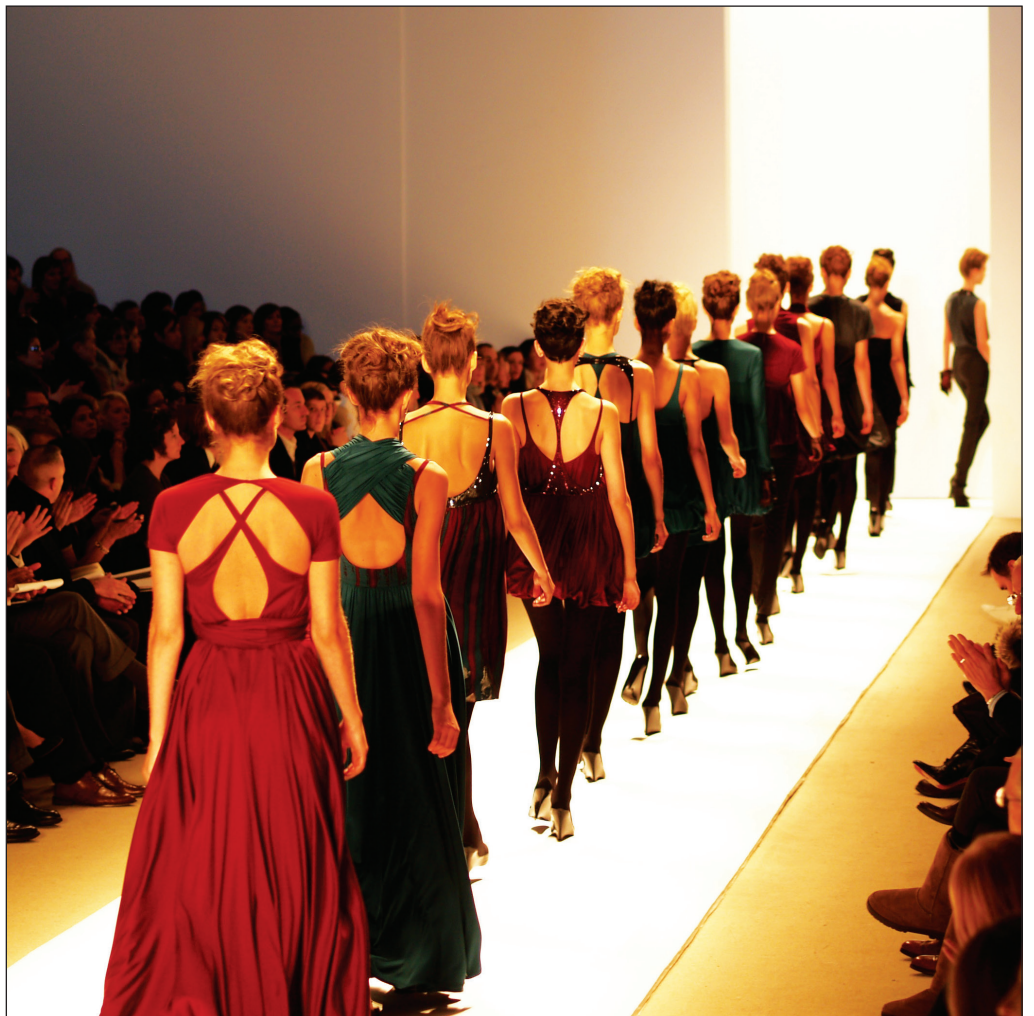
*NEW YORK FASHION WEEK FALL 2007: DOO RI* BY ART COMMENTS IS LICENSED UNDER CC 2.0.