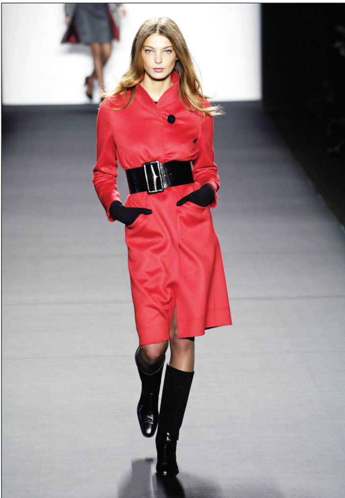
*FERVENT ADEPTE DE LA MODE/DARIA WEBOWY* BY BILL BASS IS LICENSED UNDER CC 2.0.