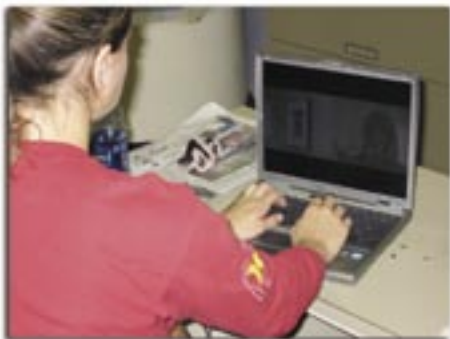
YSU students can utilize Maag's wireless laptops anywhere in the building.