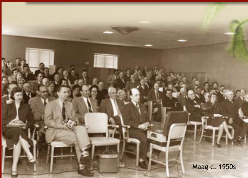
Maag c. 1950s