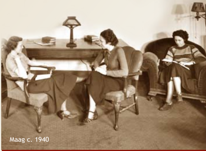
Maag c. 1940