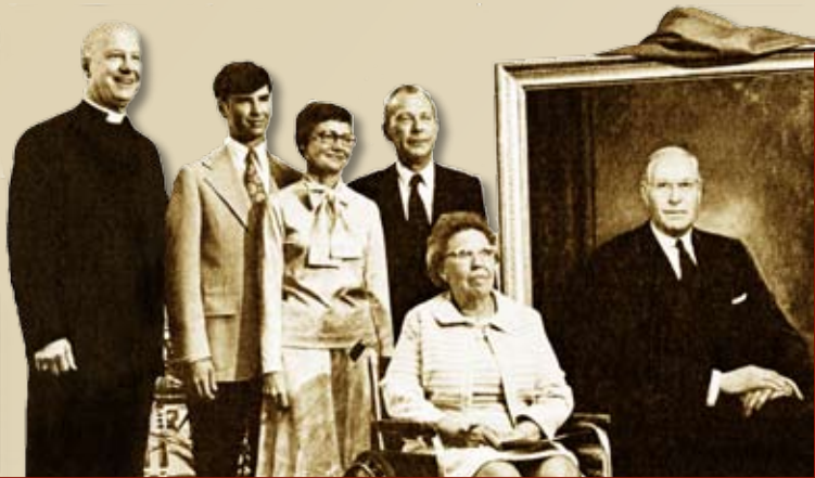
Maag c. 1970s