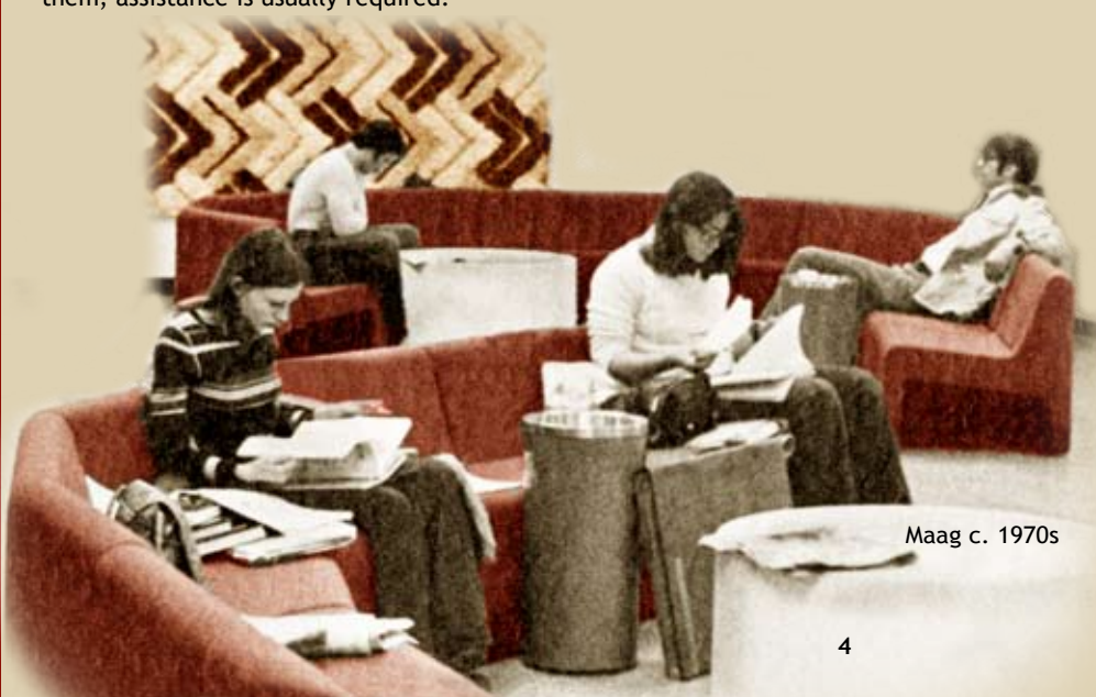
Maag c. 1970s