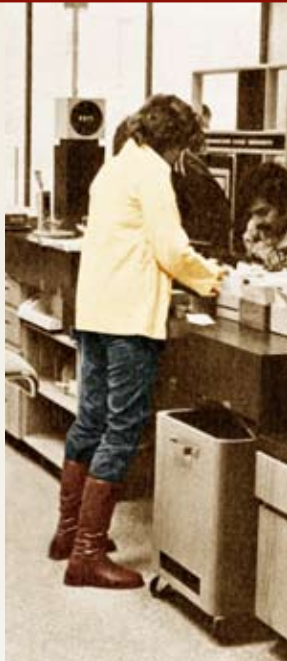
Maag c. 1970s